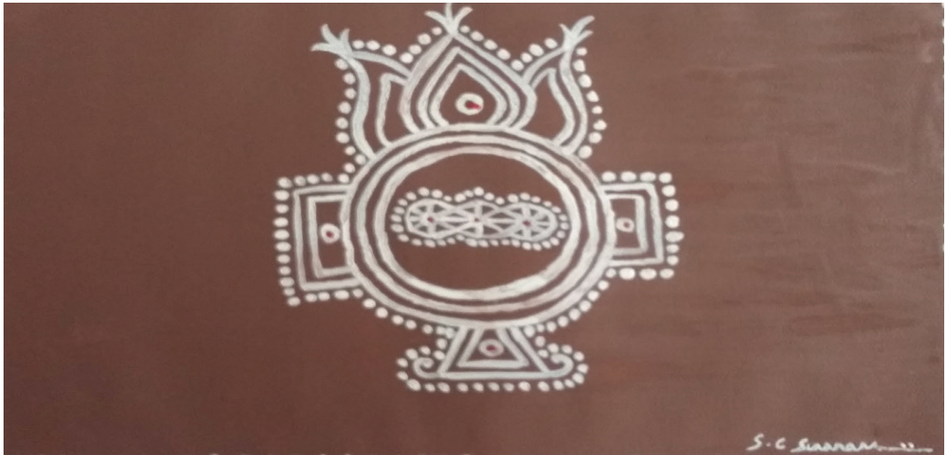
Figure 1. Tusari Puja Aripan

Young unmarried Maithil girls paint aripans on the auspicious occasion of Tusari Puja in order to get good husbands. In this occasion they draw a temple, the moon, the sun, Navagrah (nine planets) as shown in the pictures below: