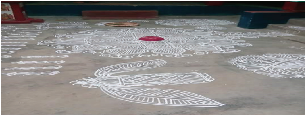
Figure 2. Sasthi Puja Aripan,

The Women making aripana without any training dominated art perpetuating the shakti cult – the female principle is dominant and lords like Bishnu or Shiva remain subordinate. Aripana links with tantra, the triangle of which represents three things – desire, knowledge, and action – brings forth the play of female powers of desire (symbolized by goddess Laxmi), knowledge (represented by goddess Saraswoti), and action (dramatized by the audacities of goddess Durga). Parbati as Durga, in particular, epitomizes the affirmation of the powers of nature, fertility, and sexuality as in the following figure of aripana shows: