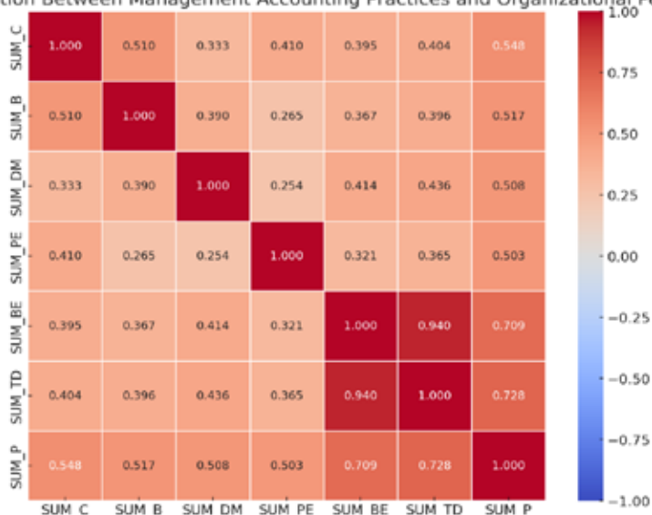
Heatmap of Correlation Between Management Accounting Practices and Organizational Performance

The heatmap above displays the correlation coefficients between different aspects of Management Accounting Practices (MAPs) — including costing, budgeting, decision making, performance evaluation, benchmarking, and time-driven activity-based costing — and organizational performance (SUM_P). The correlations were calculated based on the responses from 345 participants, offering insights into the relationship between these practices and their impact on organizational performance.