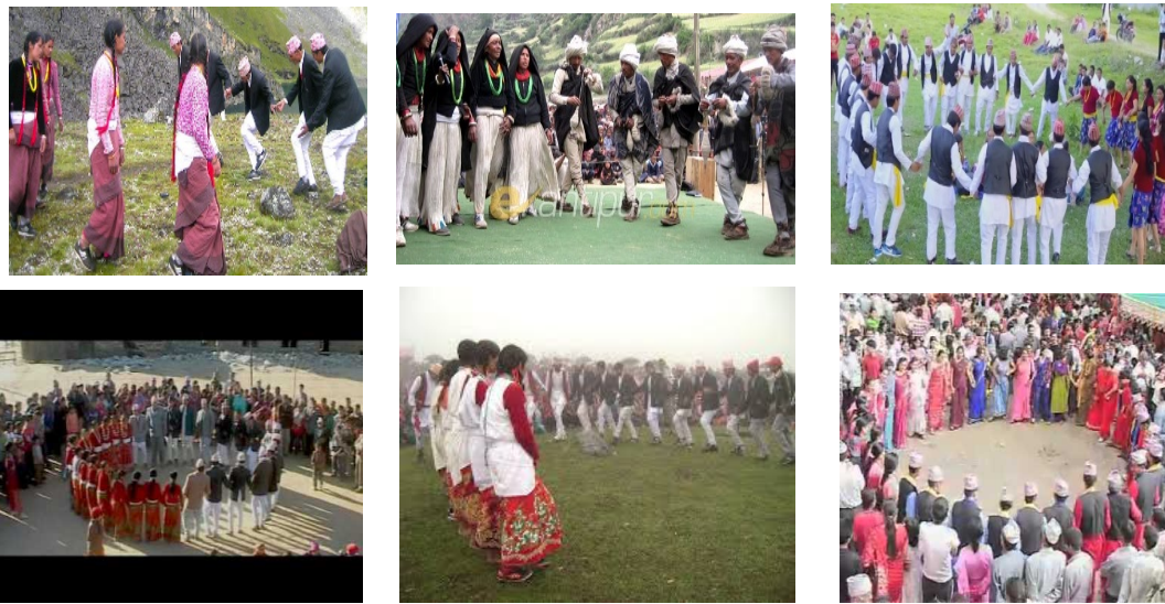
Fig. 1: Some photos of DeudaNaach, playing Deuda in different rhythm of song