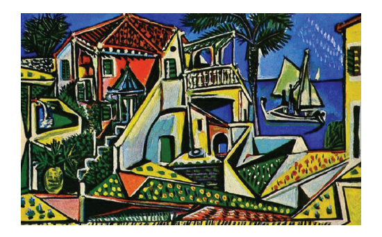
Fig. 10: Lain Singh Bangdel. Full Moon Night, 1952. Oil on Canvas.

Bangdel's Fool Moon Night emphasizes on the Nepali village (Fig. 10). He depicts Nepali architectural elements to express the narrative of the painting. The method and technique of painting are similar to Pablo Picasso's Mediterranean Landscape (Fig. 11). Although Bangdel's painting was created one year later after Picasso's painting, the pictorial form of the painting looks similar to Mediterranean Landscape; they are