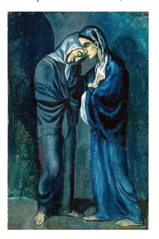
Fig. 6: Pablo Picasso. The Two Sisters , 1902. Oil on Wood.

In terms of the visual element, the painting depicts a couple—figures of a male and female facing downward and hugging each other. The sky and a hill are shown in the background of the painting,