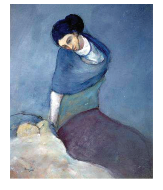
Fig. 9: Lain Singh Bangdel. Mother and Child , 1945. Oil on Canvas.