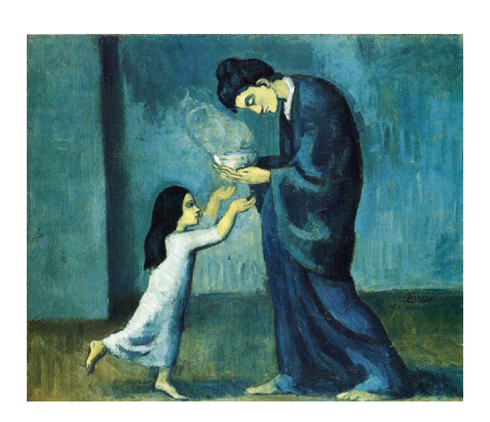
Fig. 8: Pablo Picasso. The Soup , 1902. Oil on Canvas.

Picasso and Bangdel. Mother is offering the soup to a child tenderly, in the painting; mother is watching the child affectionately. Only visible parts of the body, like faces and hands, are painted in a warm color. However, the rest of the painting is dominated by cool colors. According to the color theory, orange, red, and yellow are the warm colors, while blue, green, and purple are the cool colors. Females are emphasized in both paintings; both artists have been able to show the mothers' emotions, affections, and grief in a much more effective way to the viewers. In terms of the conventional technique in both paintings, an alla prima method is used to show the richness of the painting quality. However, both artists have followed unconventional methods of painting in terms of proportion, perspective, and human anatomy; the figures are not presented in a realistic or natural form; distortions