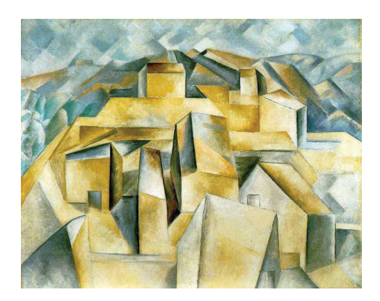
Fig.13: Pablo Picasso. House on the Hill , 1902. Oil on Canvas.