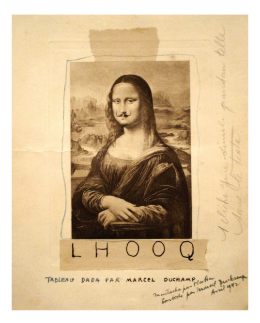
Fig. 4: Marcel Duchamp. L.H.O.O.Q. , 1919. Mixed-media.