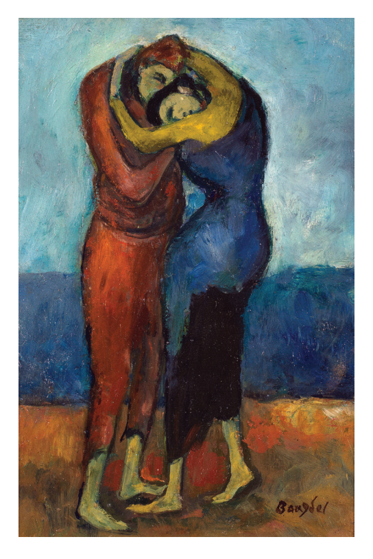
Fig. 7: Lain Singh Bangdel. Muna Madan , 1959. Oil on Canvas.