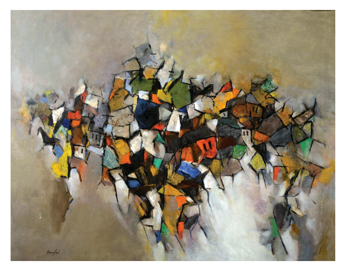
Fig. 12: Lain Singh Bangdel. Untitled, 1960. Oil on Canvas.