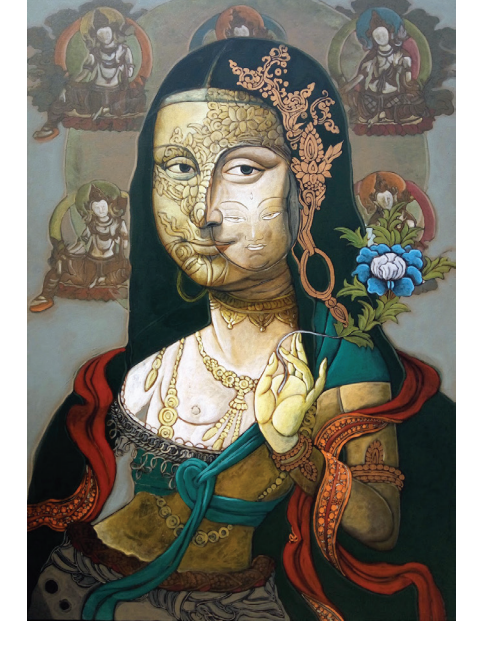
Fig. 2: Sunil Sigdel . Metamorphosis of Silence . 2018, Acrylics on Canvas.