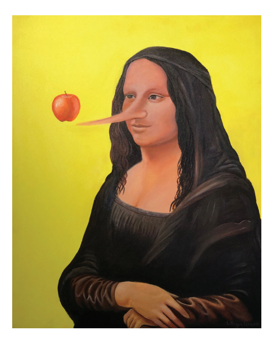
Image IX: Laxman Bajra Lama, Mona Lisa is a lie!, 2021, Acrylics on canvas, 76 cm x 61 cm.

hanging on the wall. This painting is composed in triangular composition and symbolically the triangle shows downward as the female on Mona Lisa and old woman. Artists have interpreted the famous Mona Lisa in their individualistic with direct reflection of society.