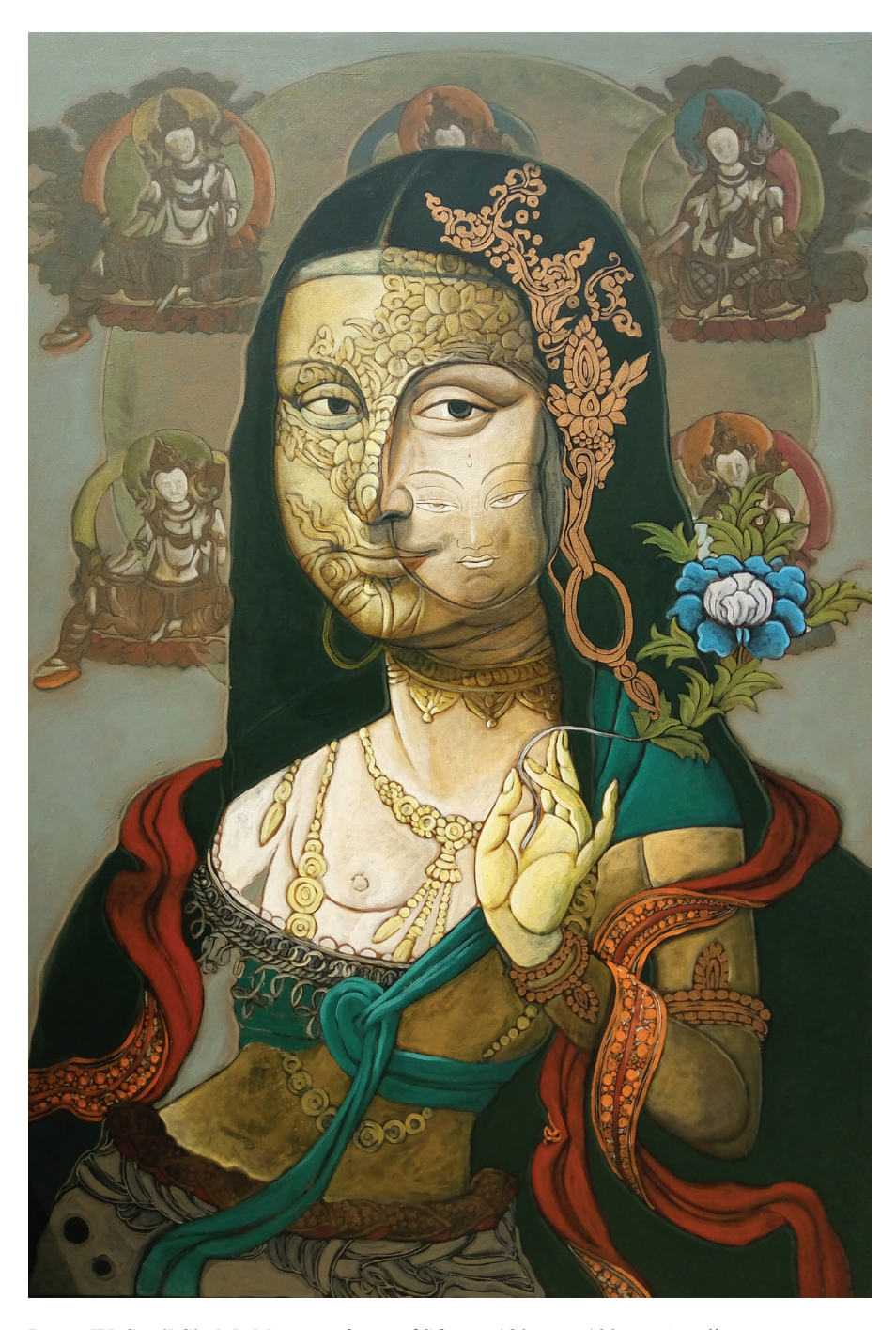
Image IV: Sunil Sigdel, Metamorphosis of Silence, 180 cm \times 120 cm, Acrylics on canvas \odot Ganges Art Gallery, Delhi, India.