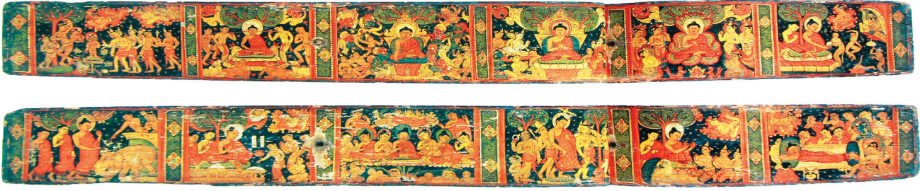
Scenes from the life-story of Lord Buddha – painted on wood, 12 th century.

serpent Mucchalinda and a monkey with offerings to the Lord. Similarly, in the second cover, one would note the successive events of his preaching and is concluded by an image of his demise – known as ‘Parinirvana – departure to his heavenly abode’. And it concludes the entire life story of Lord Buddha.