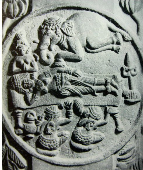
Stone-carved relief, 2 nd century BCE, Bharhut, India. Here Queen Maya Devi, the mother of Gautama Buddha, dreams her son entered her womb as a white elephant.

Back to Bilampau, to discuss its notable features and the peculiarities, select few interesting works are chosen to contextualize here. Modest efforts will be made to discuss each in chronological order. As said earlier, one of the earliest examples of a narrative visual in Nepal