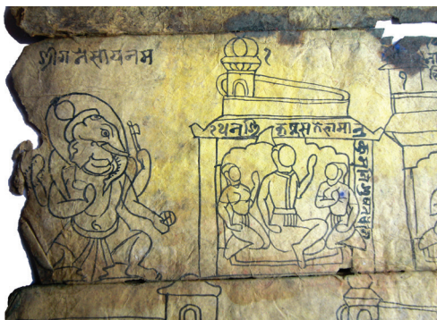
Lord Ganesha is seen first in a life-story of Lord Krishna – from a medieval sketch-book, 18 th century.

As according to the sketch guide provided, as said above, a Bilampau, almost always begins with a figure of a story teller appearing first. In case if a story is from the beliefs of Hinduism, Lord Ganesha is presented as the story teller. Herein a rough draft of an image Lord Ganesha is seen narrating the story of life of Lord Krishna. In the subsequent images, there are the important sequels from his life story. Similarly, a drawing of Lord Buddha is found as the story teller – and the audience is described as the heavenly bodies – gods. He is seen here telling the story of King Vissantara – story from the previous life of the Lord himself. Usually the popular themes for Buddhist art are the scenes from Buddha's previous lives – known as 'Jataka tales': or the life story of the Lord Buddha himself. Both these examples are found in the earlier sketch-books – maintained by the established 'Chitrakar' families – the traditional painters, of Newar society. Many families may still