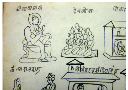
Lord Buddha as the story-teller – from a medieval sketch-book, early 18 th century.