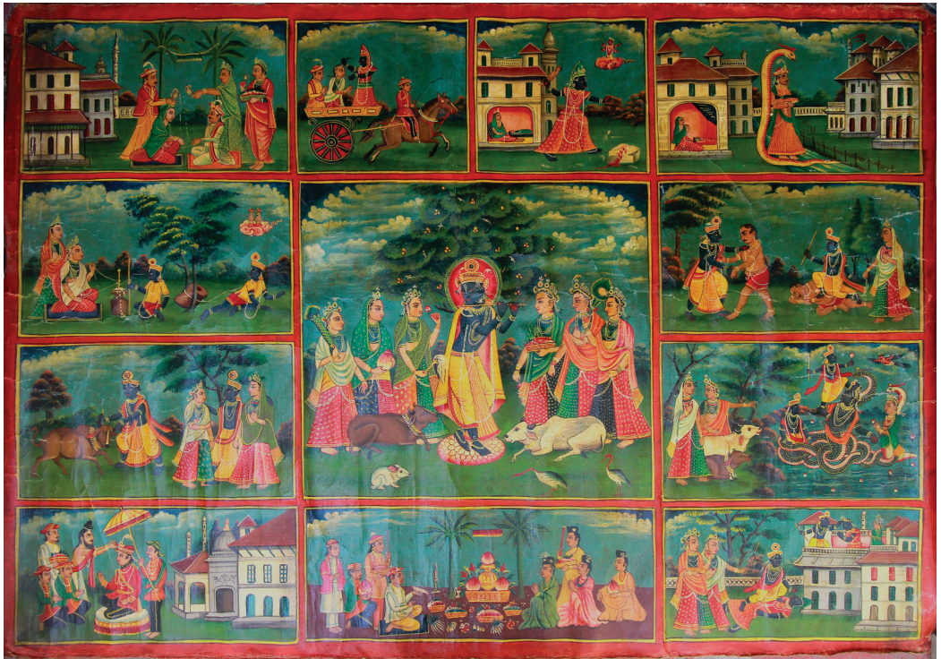
Life-story of Lord Krishna, early 19 th century. Collection: Madan Chitrakar, Kathmandu

But in later times, obviously, Nepal witnessed the phenomenal rise of Shaivite beliefs during the 16 th and 19 th century. The tradition of story-telling had taken visibly a new turn to narrating popular tales from Hinduism – and now, more in public spaces like in raised platforms known as ‘Dabalis’ or in public inns known as ‘Falechaa.’ Here the Bilampaus were found more useful tool – before a lay group of public crowd. The art was customized as a backdrop of the story-teller; so it explained the story with more clarity to the public. And it resulted in the diverse customized dimension of the later Bilampaus.