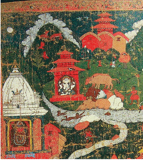
Ganesha – details from the scroll in the collection of the Philadelphia Museum of Fine Arts, USA.

diversity in contents and the style of presentations, the tradition of Bilampau art stands as one of the unique examples and an important part of Newar art heritage. Unfortunately today, desired amount of discussions and detailed research works are yet to be made.