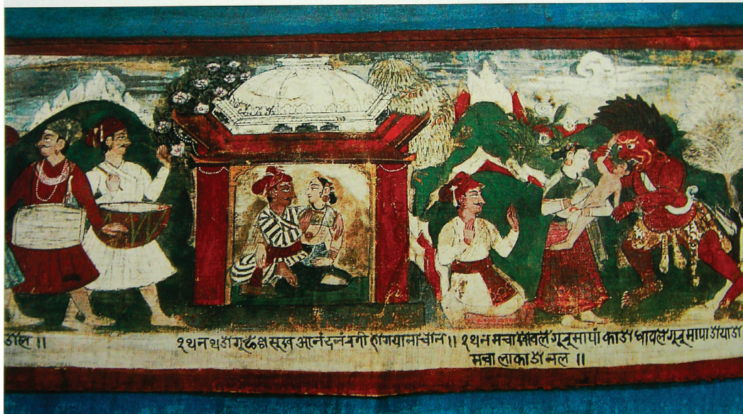
Details from a famous Bilampau of Itumbahal, Kathmandu.

length of the paintings, and this is where, most likely, tales of Buddha's life or the stories of his earlier life were being narrated quite often, by the learned head of the particular Vihar. In the later years, apparently, the tradition of such