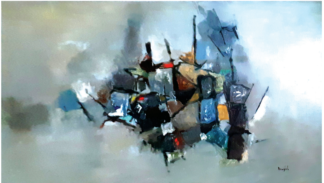
Lain Singh Bangdel , oil on canvas