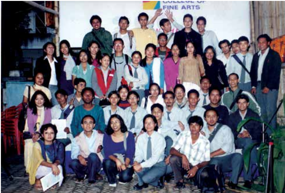
Celebrating the 3rd Anniversary of the college - September 2004

Team Work: For effective implementation of the educational activities under Sirjana College of Fine Arts, its team spirit has been found to be significantly harmonious. The College Management Committee operates and coordinates with the Principal, Program Coordinator and the Faculty Members as well as non-teaching staff at the college.