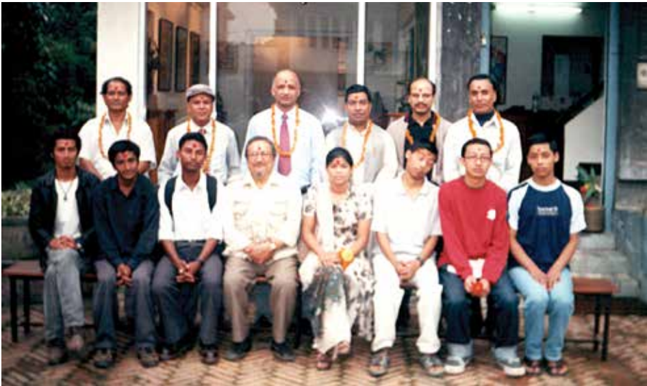
The day when Sirjana College of Fine Arts came into inception with a number of seven students, August 24, 2001