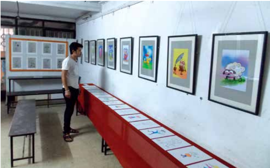
Display of the works by BFA 4th year students, 2016

From the very beginning, the college has been running its operations in a rented building at Uttar Dhoka Sadak, Lazimpat, Kathmandu-2. But the devastating earthquakes that struck Nepal in April and May, 2012, destroyed livelihoods, infrastructure as well as educational institutions like ours. Our college has also been badly affected by the last earthquakes. The upper stories of the building have turned unsuitable for running classes. Therefore, the classroom activities are being carried out in a temporary truss built in the courtyard of the college building.