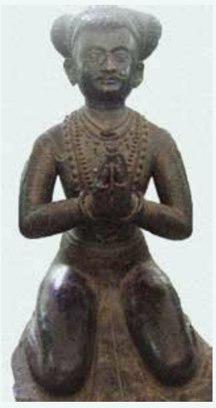
An image of Amshuverma, National Museum, Chhauni

The king went in person to see her off, he went as far as Mangyul, (Mustang) the border of Nepal and Tibet.