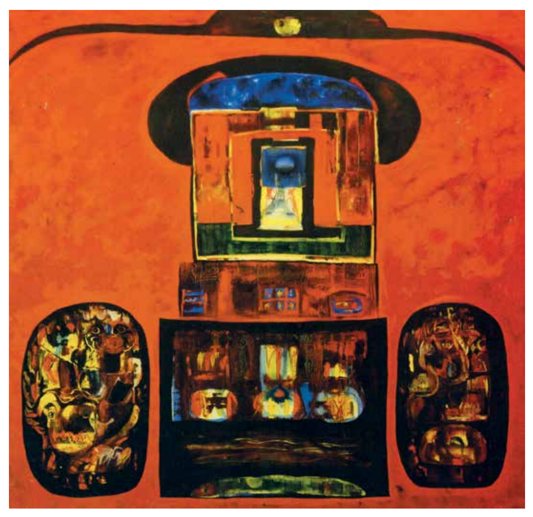
Pramila Giri. Tibet Series I. 1991. Oil on canvas. 190 cm x 192 cm.

visualizes in deep thoughtful meditation. She added she was trying to express her inner emotions and the feelings. So she is not interested in the natural forms. Some viewers may find male and female forms but they do not represent as serious expression. Our scriptures also describe there are no difference of male or female figure in absolute totality or Sampurnata.