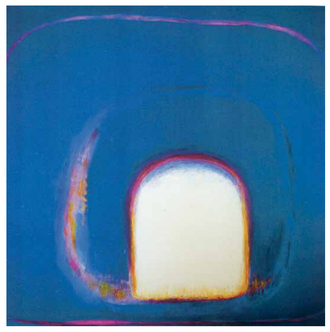
Pramila Giri. Blue Series I. 2010. Oil on canvas. 195 cm x 195 cm.

abstract, and evoke aesthetic feelings and compel the viewers to think. This is regarded as the success of the Bhairav series.