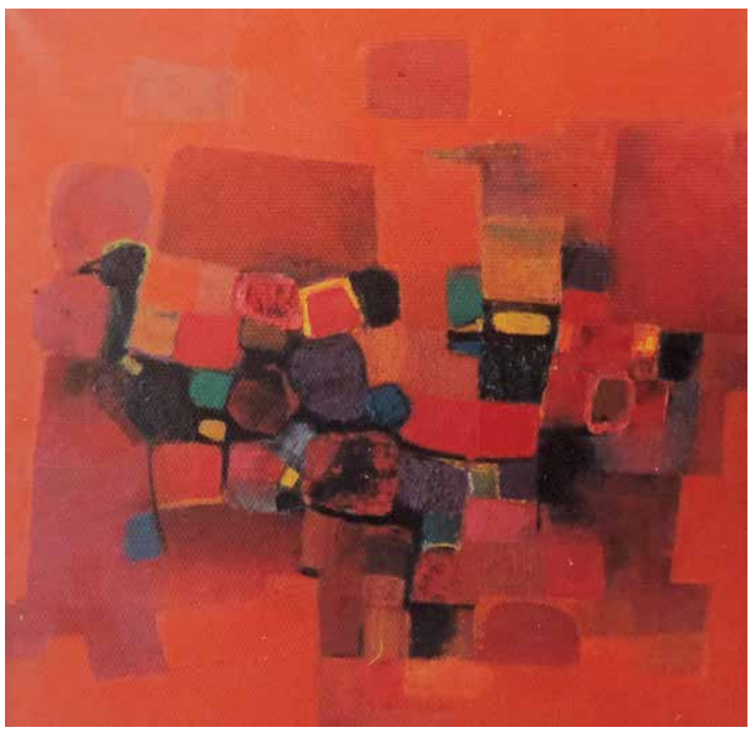
Krishna Manadhar. Composition. 1975. Oil on canvas. 122 cm x 95 cm.

stallion is in its mythologizing process. Time extends to a larger space and covers the world of myths.