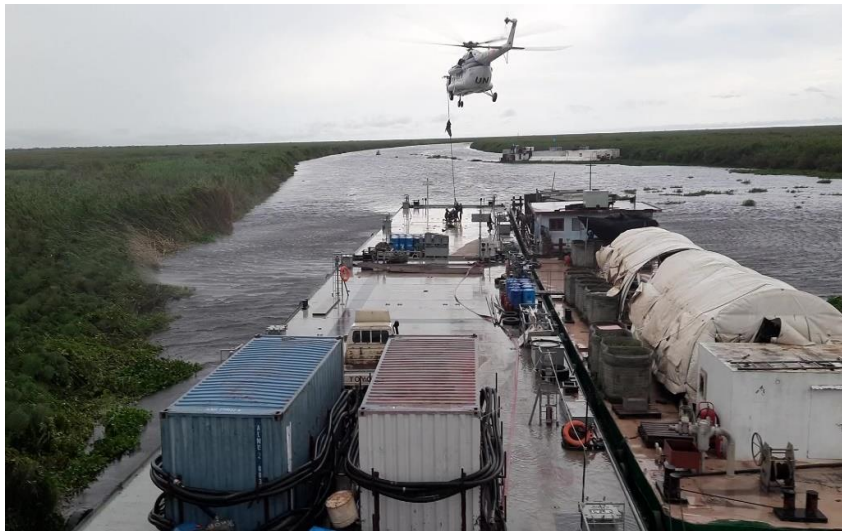
NEPHRC conducting heli-insertion at Legno on the barge