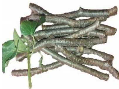
Fig.1: Tinospora cordifolia

T. cordifolia contains 4.5%-11.2% ample protein, 15.9% fiber, 61.66% carbohydrates, 3.1% low fat, 0.845% potassium, 0.006% chromium, 0.28% iron and calcium 0.131% calcium. It contains nutritional value of 292.54 calories per 100 g (Khan, et al. , 2011). The studies of analysis of phytochemical of plant indicates the presence of a wide varieties of phyto-constituents which are lactones, alkaloids, glycosides, diterpenoid, sesquiterpenoids, hormones, aliphatic compounds, phenolics, and actively presence of ingredients like polysaccharides (Thatte et al. , 1991; Khan et al. , 2016).