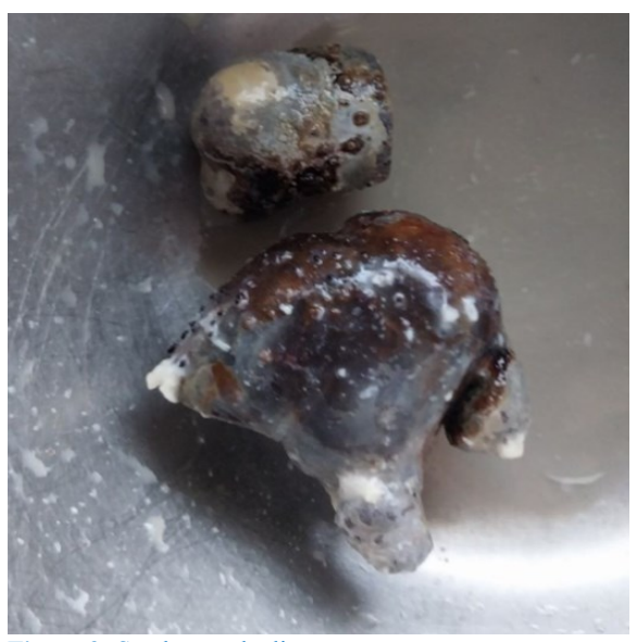
Figure 3: Staghorn calculi