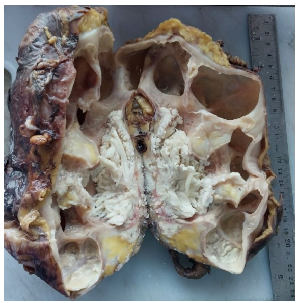
Figure 2: Cut surface of kidney with whitish solid mass