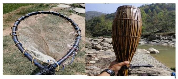
Fig. 2: Photos of Fishing Implements