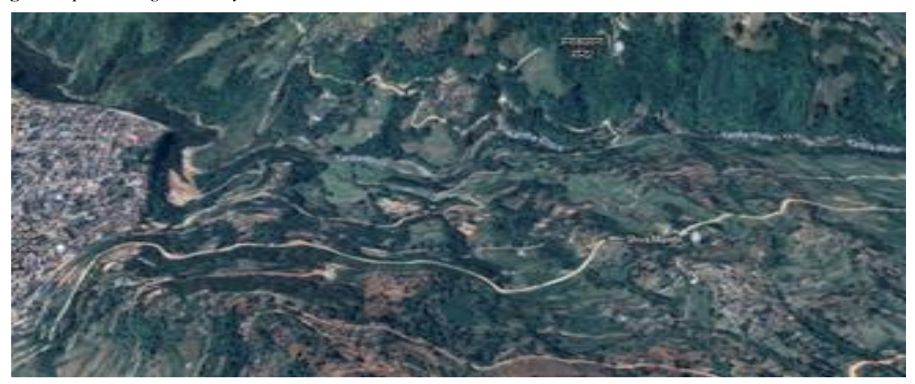
Fig. 1 Map Showing the Study Area