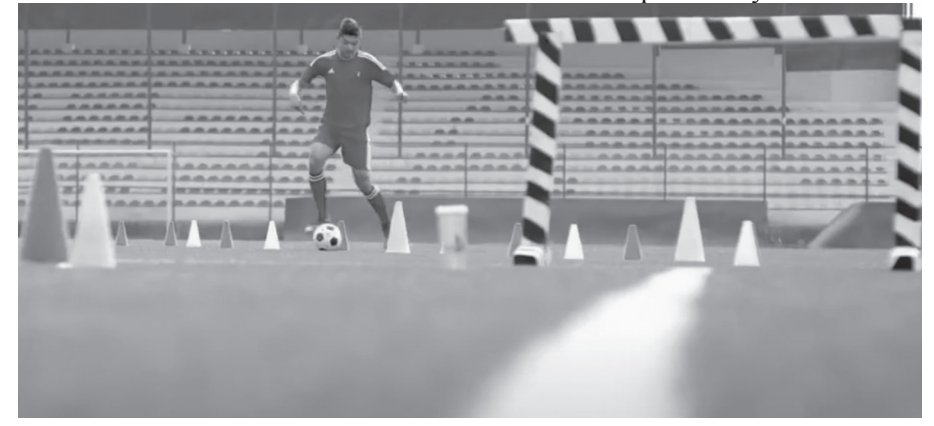
Figure 5. A still image from the Glucose D commercial, retrieved from YouTube https://www.youtube.com/watch?v=aQq4tz1gLhQ

reinforce football as male's business. On the other hand, women are always given a caring responsibility that naturalises women as a carer and unburdens males with this responsibility.