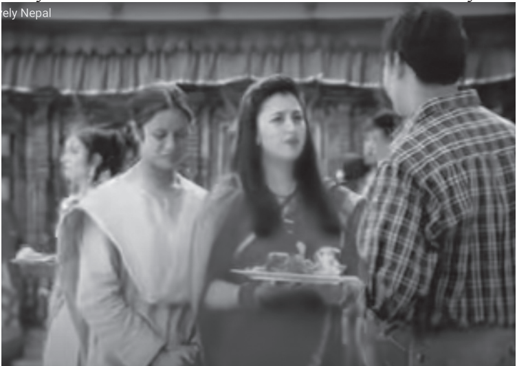
Figure 6. A still image from the Fair and Lovely commercial

Okhati soap also features fair, spotless, and slim female models indicating this effect of this product however soaps are used by males too. And the whole advertisement is voiced by a male voice.