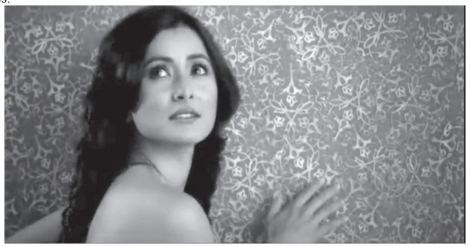
Figure 7. A still image from the Burger Silk commercial

Jasmine paint presents two popular artists of Nepali comedy who are smeared in paint while trying to rob a house. This commercial involves both genders, and avoids erotic use of females although it is voiced by only males.