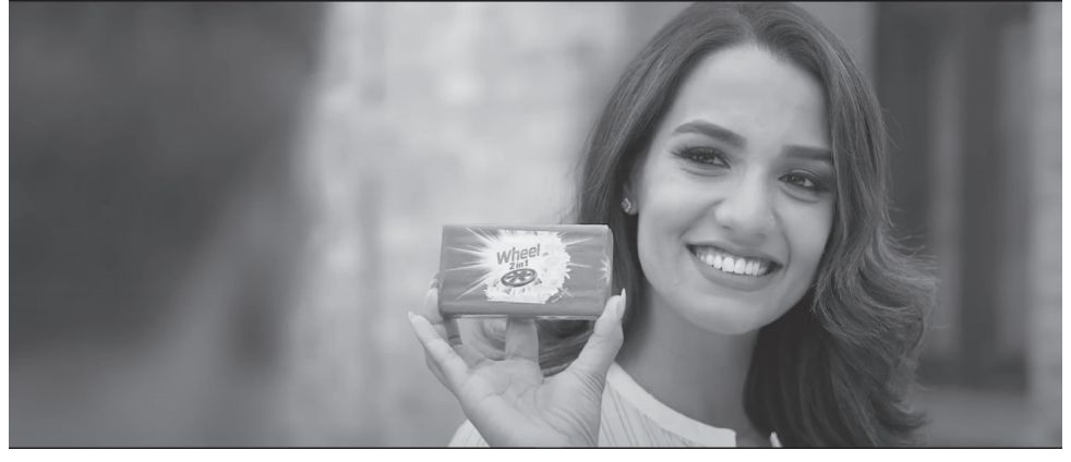
Figure 3. A still image from the Wheel commercial

These commercials dominantly present women doing washing jobs which is also commonly seen in Nepalese society. In most of the Nepalese community, laundry duty is that of females and mostly women are supposed to wash all the family members' clothes as seen in the commercials. However, men washing females' clothes are rare and often pecked negatively. Sticking to the social gender norms these commercials promote these norms and maintain gender bias.