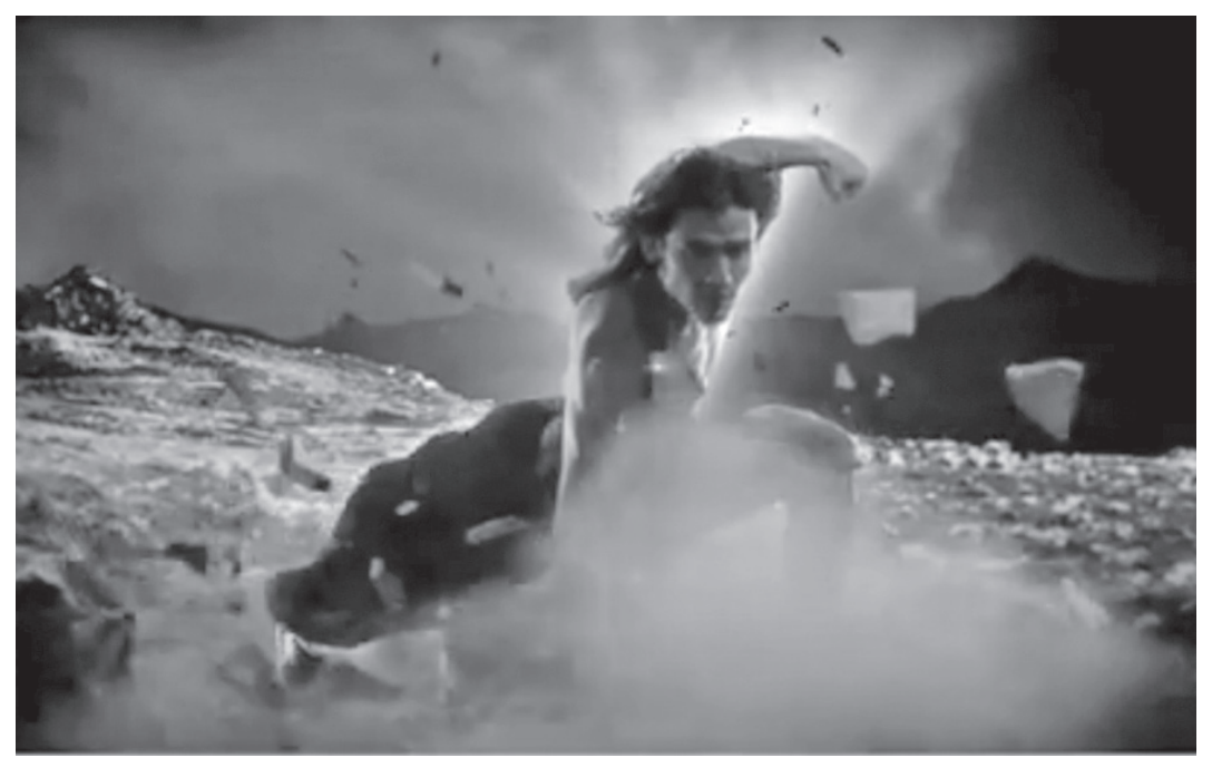
Figure 1. A still image from the advertisement of Shivam Cement

muscular male performing an act showing strength, durability, and safety gestures. This commercial use only a male voice. However, another commercial belonging to Siddharths is inclusive of various characters like male/female and adult/children. The character details show women gossiping, dancing, crying, putting on makeup, against males passing love letters, reading, stealing, and showing aggression. This advertisement is also voiced by a male character. Lastly, the Hongschic Cement advertisement presents an animated lion as a symbol of power backed up by a male voice. Even though there can be seen improvement in gender inclusiveness in some commercials there is still dominancy of the male voice and stereotypical projection of human emotions and activities. Traditional gender-specific appearances such as gender-specific clothes and hairstyles are maintained throughout the commercials.