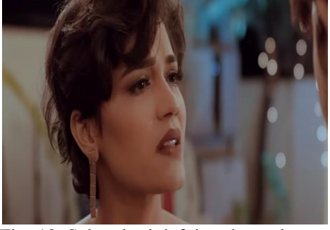
Fig. 10. Sakambari defying the male authority (00:13:07)

The figures in Fig. 9 and 10 exhibit contrasting moments of women declaring their autonomy and dismantling societal constraints. Nora's resistance culminates in a powerful act of emancipated embodiment by removing her wedding ring and handing it over to her husband. This performative act refers to an open challenge to the male regime and her decision to break free from the marriage signifies being independent. As to bodily acts and performative both women in the images show, Praise Zenenga states, "Power of the body expresses different kinds of power, such as political power, intellectual power, spiritual power, physical power, social power, and even economic power" (65). The body can manifest and manipulate various forms of power, including political, intellectual, spiritual, physical, social, and economic growth. Both posture and demeanor further emphasize the new independence. The strength that comes from reclaiming control over her own life leads Nora to the path of freedom and equality. This act of defiance goes beyond mere rebellion; instead, it's a conscious decision to forge her path, free from the constraints of an unhappy marriage.