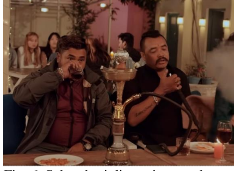
Fig. 6. Sakambari disrupting gender stereotype (00:06:52)