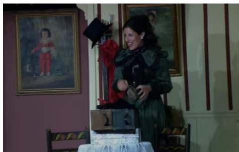
Fig. 1. Nora busies with household chores (00:01:00)

Both Nora and Sakambari's performative bodies initially conform to societal expectations. Being an obedient wife, Nora's fashionable clothing and playful nature mirror her as a doll expected by her husband while Sakambari's simple attire and domestic chores in the village reflect her role within the domestic sphere, prioritizing family needs and being expected to perform physical labor. Although Nora lives in the city as a dutiful wife and Sakambari in the village as a dutiful daughter, both represent the expected feminine characteristics of both societies. The following images show how both of them conform to social expectations through the submissive embodiment.