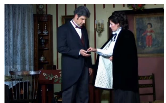
Fig. 9. Nora quitting her marital bondage (02:12:28)

Nora and Sakambari eventually defy societal expectations and claim agency and power through performative bodies. Nora decides to quit her marriage, seeking a life of self-realization and autonomy, while Sakambari reclaims her space and fights for her rights. However, the path of body performatives they take to liberation differs from one another. Deepti Misri argues that "naked protests in India contribute to shaping and reshaping gender norms in the long run, although they don't impact immediately" (603). It is crucial to assess the nude protests as a valid means of women's protest in India, taking into account their impact on gendered norms and emphasizing the necessity of deconstructing the gender binary. Nora's bodily liberation relates to a conscious decision to break free from a stifling environment, while Sakambari's freedom might lead to a more gradual process of self-discovery and empowerment in a social structure. The images explicitly show how both protagonists resist the male-centric structure.