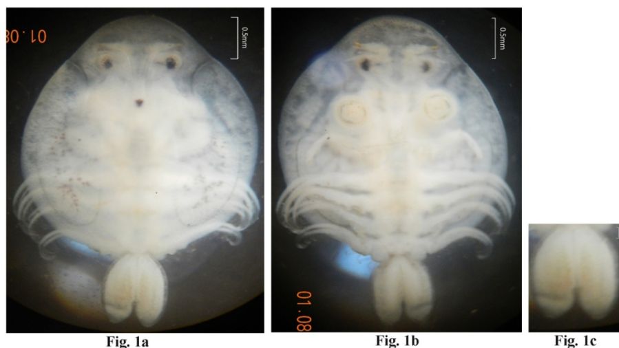
Fig. 1: Male of Argulus japonicus Thiele 1900 viewed under a light microscope (4x) (1a dorsal view, 1b ventral view; 1c abdomen with a pair of testis (3.75 mm TL, 0.90 mm AL))