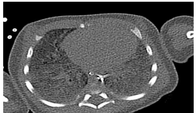
Figure 2. Non-contrast CT axial view in lung and mediastinal window showing ground glass appearance of bilateral lungs