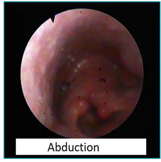
Fig. 2: Abduction of the vocal cords

in the past except for COVID-19 infection in the last six months confirmed by PCR. He presented to our otorhinolaryngology outpatient department with a complaint of hoarseness of voice, six months after recovery from COVID-19 pneumonia for which he was admitted to ICU for two months and was given respiratory support through a nasal mask. However, no endotracheal intubation was done thus eliminating any possibility of traumarelated etiology. The patient had a long history of alcohol consumption and chewing tobacco for the last 30 years until he became severely ill with a COVID-19 infection. There was no history of any surgery in the past.