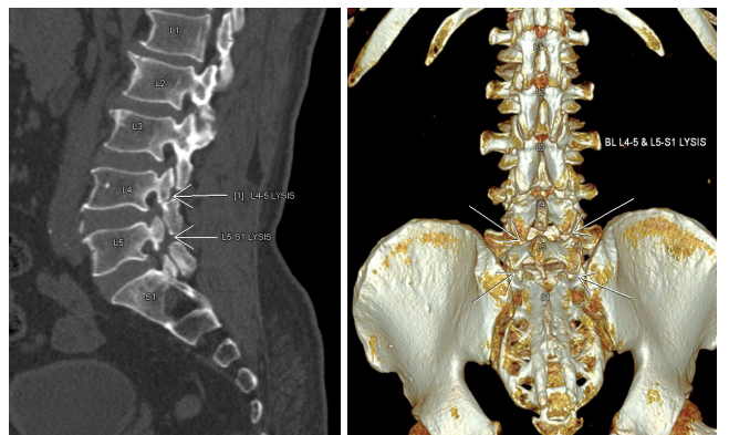
Fig. 4: a) Sagittal CT MPR image of L4-5 and L5-S1 spondylolysis (arrows) b) Posterior view of 3D CT image of bilateral L4-5 and L5-S1 spondylolysis (arrows)