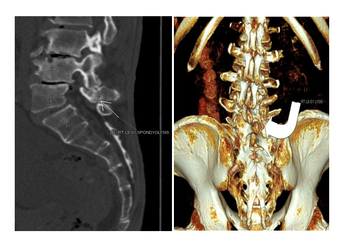
Fig. 2: a) Sagittal CT MPR image of L5-S1 spondylolysis ( arrow ) b) Posterior view of 3D CT image of right sided L5-S1 spondylolysis ( curved white arrow )

followed by 27 patients (18.5 %) in 51-60 years age group. Out of 146 patients with incidental lumbosacral spondylolysis, 71 were males with 6.2% prevalence and 75 were females with 5.0% prevalence (Table 3). Females (5.0%)