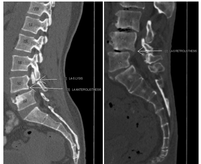
Fig. 5: a) Sagittal CT MPR image of L4-5 spondylolysis with grade 1 anterolisthesis of L4 over L5 (arrows) and b) grade 1 retrolisthesis of L4 over L5 spondylolysis (arrow)