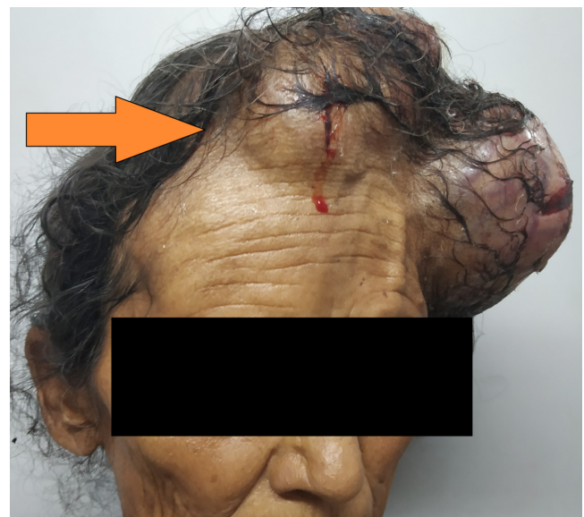
Fig. 1: Soft tissue tumor of the scalp

The treatment of these large tumors is challenging. Wide local excision is the treatment of choice but the difficulty in case of scalp tumors is the defect closure which requires tissue flaps. 7 Even after transfer, it is not cosmetically aesthetic due to the lack of hair over the transplanted portion. 7 In case of bony and cerebral invasion, these tumors can present with emergencies like intracerebral or extracerebral bleed. Limited invasion of the brain parenchyma can be treated with excision but large lesions are often unresectable and are associated with morbidity. Even if they are resected with negative margins they are associated with a high recurrence rate of around 20%. 8 There are no specific treatment guidelines for STS of scalp. Adjuvant radiation has not shown to reduce the rate of recurrence.