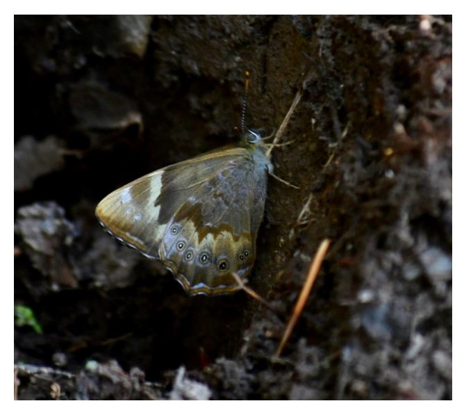
Figure 1. Lethe nicetas Hewitson, 1863 observed in Rara National Park

abroad. For the map preparation I have downloaded freely available map data from websites nationalgeoportal.gov.np,