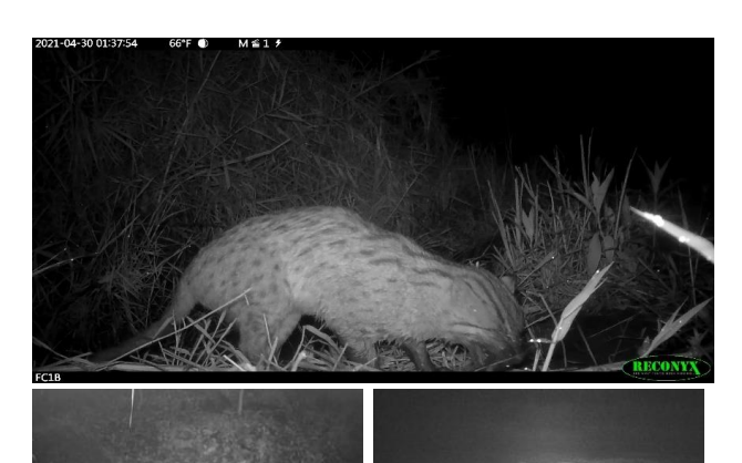
Figure 2. Fishing cat images: A) captured in grid ID:FC1 through FC1B camera at a shallow water hole near Rheu River, B) captured in grid ID: FC3 through FC3B camera at a shallow water hole near Rapti River, and C) captured in grid ID: FC4 through FC4A at a shallow water hole near riverbed of Rapti River.

With the 130 camera traps night effort, we captured 16,081 images. We obtained images of fishing cats from three camera trap locations (Fig. 2, Table 2). All three locations