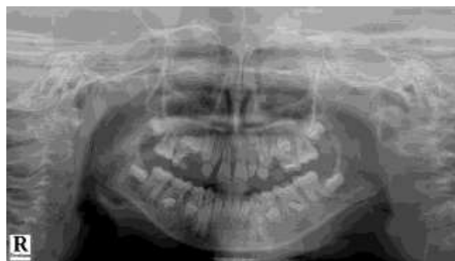
Figure 4: Panoramic radiograph with peg shaped 12 and 22