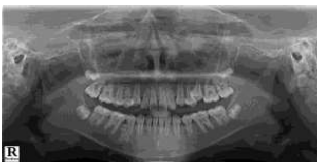
Figure 1: Panoramic radiograph of a patient with dens-in-dente with respect to 12 and missing 22

based on mutual consensus. The data was entered in Microsoft Excel 2019 and analyzed in Statistical Analysis for Social Science (SPSS) version 25 (IBM, Chicago, US). Cross-tabulation were done using descriptive statistics. Chi-square test was used to compare the prevalence of dental anomalies based on gender.