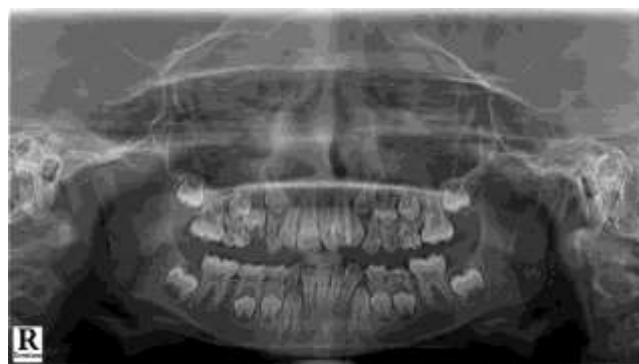
Figure 3: Panoramic radiograph of a patient with rotation wrt 22