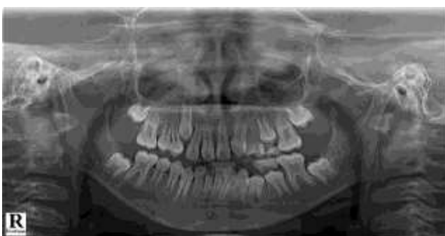
Figure 2: Panoramic radiograph of a patient with supernumerary tooth in maxillary anterior region