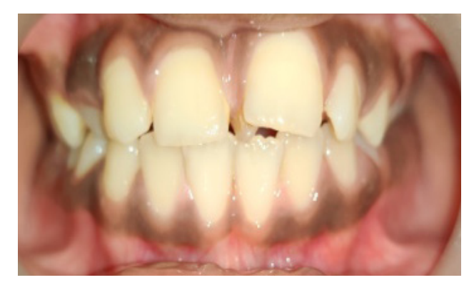
Figure 2: Clinical picture showing mesiodens.

to surgical procedure. Intra-alveolar extraction (forceps technique) of erupted supernumerary teeth was done. Post extraction instructions were advised and healing was satisfactory.