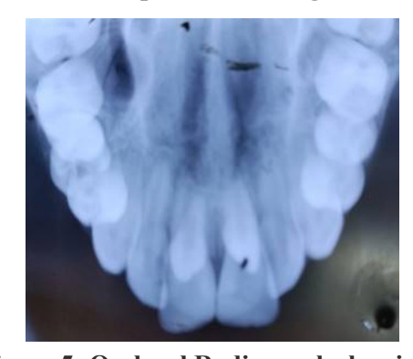
Figure 5: Occlusal Radiograph showing Mesiodentes.