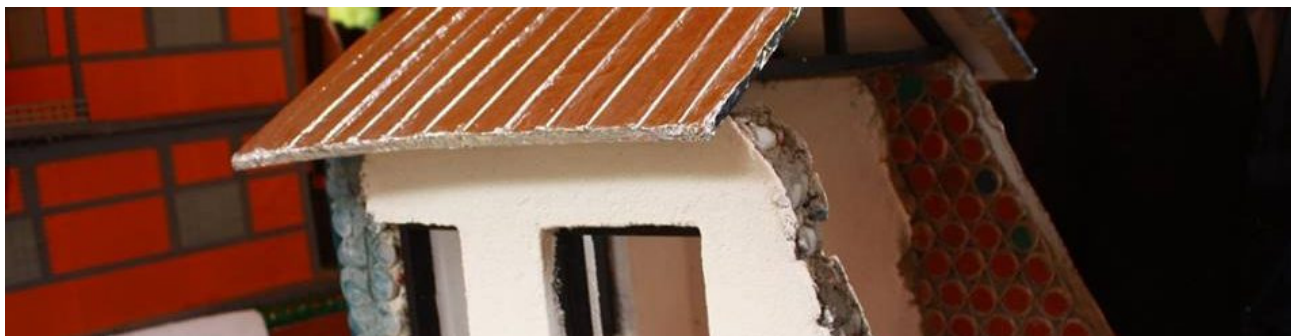
Figure 2: Placing a wide picture [Discouraged! as it always appears at the top of a page (next available page).]