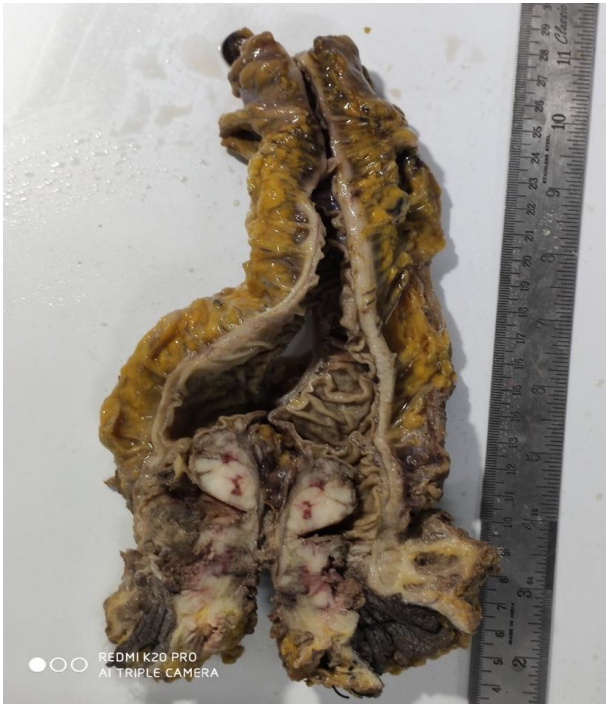
Figure.1 Gross image of rectal melanoma

lymphoma, poorly differentiated carcinoma and melanoma.