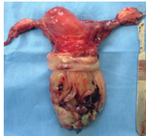
Figure 2: Gross appearance: Polypoid fleshy tumor protruding from ballooned up cervix, with evident dimpling of the left portion of the uterine fundus.