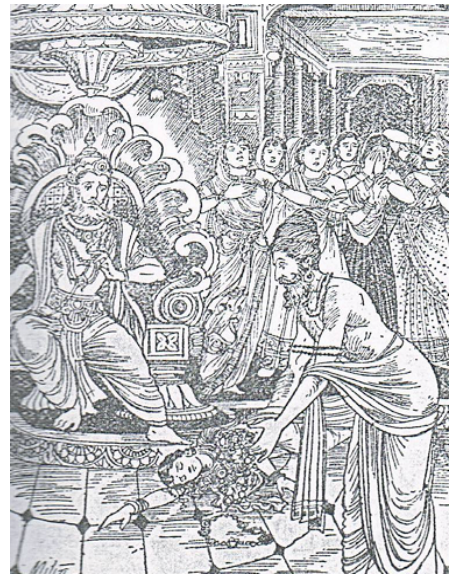
Disguised Demon addressing Shatrujit

This sage who was a demon arrived in the court of King Shatrujit. Madalasa was also present in the court. He said- 'Prince Ritudhwaj sacrificed his life fighting with the demon while protecting my hermitage. Before his death, he gave me his necklace. His horse has been captured by the demon. I have brought this necklace to you to inform you about that sad incident.' After giving the necklace to Madalasa, the demon returned to the hermitage. On hearing the news of her husband's death, Madalasa gave up her life. The palace was engulfed in sadness. On seeing the death of his daughter-in-law, King Shatrujit was in a dilemma as to whose death should he mourn his son or his daughter-in-law. A little contemplation led him to the conclusion that it would be futile to mourn his son- Ritudhwaj's death because he had died fulfilling his duty, for a noble cause. But his daughter-in-law had followed the steps of her husband, so her death should be mourned for. The queen also supported the king. Thereafter the king performed the last rites of both of them.