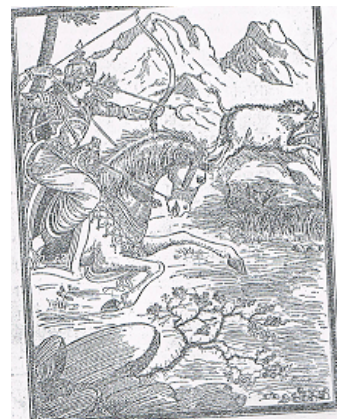
Ritudhwaj chasing the Boar (Demon)

Prince Ritudhwaj stayed in the hermitage of sage Galava and helped him to perform his Yajnyas without being disturbed. The demons were unaware of his arrival in the hermitage. One day, a demon arrived in the hermitage disguised as a wild boar and began to rub his bushy head against the body of sage Galava. Seeing this, his disciples created an uproar.