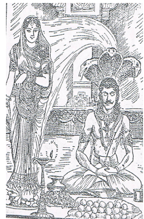
Ribirth of Madalsha

Following that, Ashwatar the Naga King and his brothers went back to their realm, Paatal Loka (the Underworld), and conducted a Shraadh according to the Lord's instructions, and ate the middle half of the food that was offered to the ancestors. Madalasa broke free from her death at once. Ashwatar made the necessary preparations to enable her to live in secrecy and kept this information from others. He gave his sons the order to summon their friend Ritudhwaj to the palace.