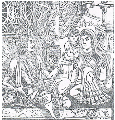
Ritudhwaj & Madalasha with their son Alark

Ritudhwaj told his parents the entire story of how he got back Madalasa after arriving back in his father's realm. They then started leading happy lives. Ritudhwaj became king after many years of rule by King Shatrujit. Madalasa gave birth to her first son Vikrant, following King Ritudhwaj's coronation. After a while, Madalasa gave birth to her second son, Subahu. Their third son, Shatrumardan, was born after that. Madalasa was amused by the name given to her son and burst out laughing during the third son's naming ceremony. Madalasa's three boys were able to become ascetics thanks to the metaphysical wisdom she imparted to them. When their fourth son was born, Madalasa gave him the name Alark at the king's request. The king laughed at the name and its meaning. Madalasa asserted that the names are only significant in the material world. She also brought up the point that their previous children's names were meaningless to the king.