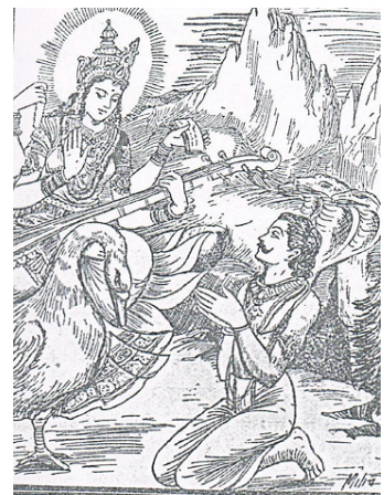
Raja Aswatar & Goddess Saraswati

"Oh father!," exclaimed the Naag sons. Ritudhwaj, the prince, now leads a penance-filled life. He just enjoys playing with others of his age and never looks at ladies. To