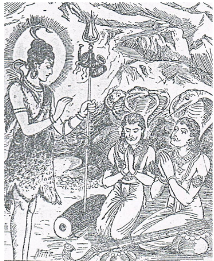
Kambal & Ashwatar & Lord Shiva

keep him happy is the only thing we can do for him. The snake god, Nagaraj, became quite thoughtful after hearing the whole story. Afterwards, he laughed and shouted, "O sons!" to his boys. It is now my intention to do something that will make your darling Prince smile again. By saying this, Nagaraj Ashwatar and his brother Kambal arrived at Plakshaavataran, a holy site in the Himalayan foothills. They commenced performing intense penances to appease Goddess Saraswati, often known as the Goddess of Knowledge. Finally, Saraswati materialised in front of them and told them to ask for a boon.