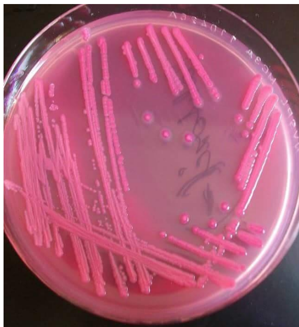
Fig 2: Media plate showing growth of E. coli

Among the total growth positive isolates, the highest number of organisms was found to be Escherichia coli (35.4%) followed by COPS (Coagulase positive Staphylococcus ) (22.9%), CONS (Coagulase negative staphylococcus ) Saprophyticus (18.7%), Group D Streptococci (10.4%), Enterobacter spp (2.1%), Klebsiella oxytoca (2.1%), and Proteus mirabilis (8.3%) are as shown in Table 3.