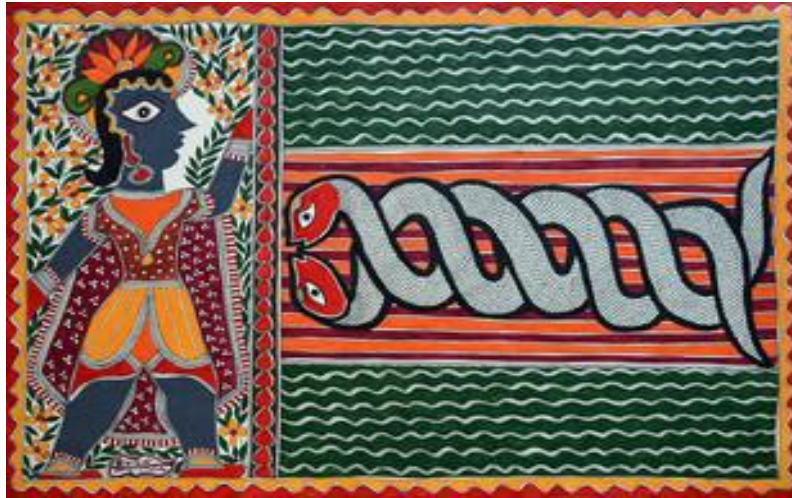
Artist: Baua Devi

without feminine help, the creativity is not possible. Projecting sexual intimacy in terms of the source of creation is another imperative factor of Mithila paintings that portrays sexual indulgence as a work of creation.