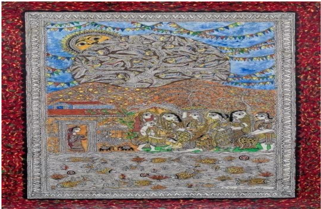
C. Sunman, Nava Barsa , 2015

These images and symbols discussed above in the paintings admit female essentiality. The male-female harmony can be seen in the images presented in different paintings by different artists. By openly discussing the implications of these religious symbols, we can promote male female parity and gender equality in the society. The conscious use of these symbols can inform equality and critique the patriarchal tendency of society. In modern days, these paintings have become a platform for women economic empowerment, a medium of women's resistance, and expression. However, the proliferation of a systemic and conscious effort in digging out the message of Tantric symbols is yet to be made.