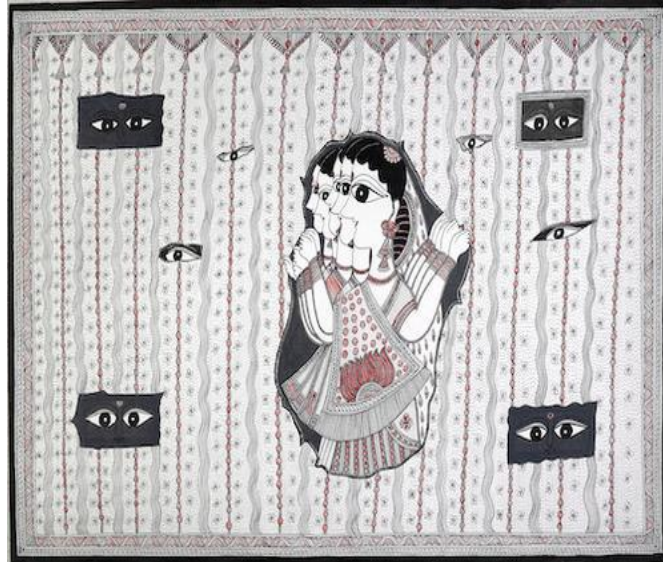
Rani Jhah Together Tearing the Veil

single eyes peeping from inside the veil, indicating women who are unwilling to go out of the veil. This painting encourages women to come out of the traditional norms of purda , which is one of the major obstacles in the way of women's progress and empowerment. This painting also acknowledges the patriarchal dominance in Mithila culture in the image of purda and the images of women still inside the veil.