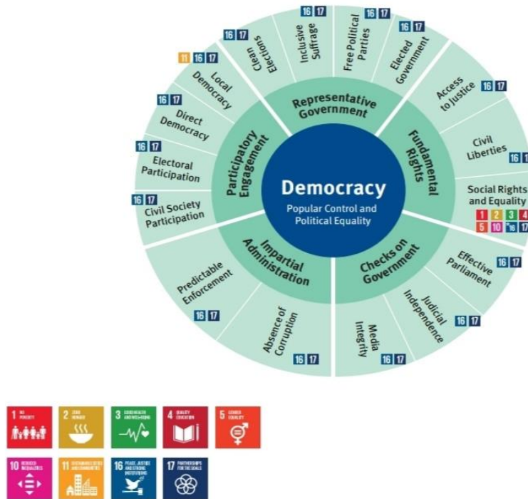
Fig (1)- Chart representing the fundamental determinants of a Democratic system