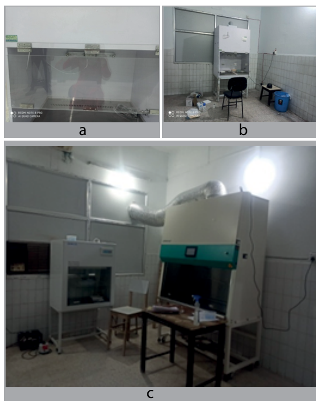
Fig 3: (a) Broken glass of biosafety cabinet, (b) Malfunctioning filter, (c) New biosafety cabinet.