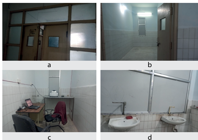
Fig 2: (a) Entrance (b) Sealed windows (c) Installed PCR machine (d) Handwash areas

issues at hand by communicating with their colleagues and the representatives of Nepal Bio-medical Engineer's association. After an intensive period of problem identification by the team, it was concluded that the cabinet needed replacement. It took almost 2 weeks to buy and install another biosafety cabinet. However, the glass window of the cabinet was broken during transportation. The maintenance team helped change the glass window the next day. In parallel, part of the team was mobilizing instruments such as pipettes, tips, vortex, centrifuges, hot water bath, ice-maker, distilled water to start the actual testing. Most of them were bought from the local suppliers.