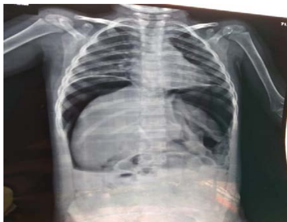
Fig 1: Free gas under both domes of diaphragm

3 years old female patient was brought in the emergency by her parents with the history of fever for 17 days which was not documented, partially relieved by the medication, and was not associated with chills and rigors. She also complained of pain abdomen which was generalized, without any relieving or aggravating factors and was not associated with vomiting. On examination, general condition was ill-looking, lying supine on bed, vital were within normal limit. Abdomen was distended, tender with generalized guarding and rebound tenderness. Liver dullness was obliterated and bowel sound was sluggish.