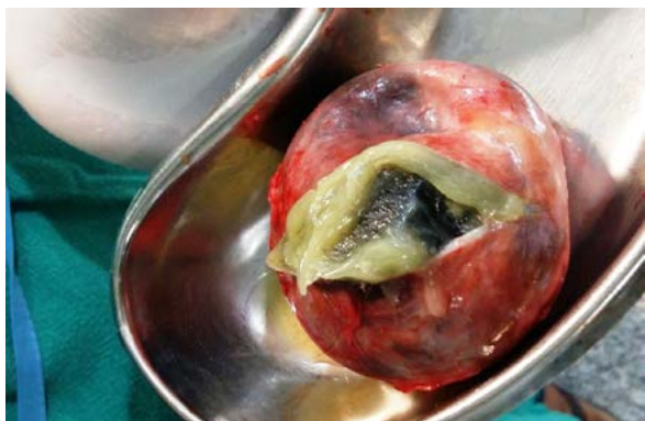
Fig 2: Cut section of dermoid cyst showing cheesy material & hair

Histopathological report revealed ovarian cystic structure measuring 11.5×5.5 cm containing thick cheesy secretion, hair and solid component. The cystic wall was fibro-collagenous and consist of lobules of many sebaceous gland and congested blood vessels, nerve twigs, apocrine glands, lymphatics, hair shafts along with few chronic inflammatory cell infiltrate and macrophages. No immature components/atypia were seen thus confirming the diagnosis of mature cystic teratoma.