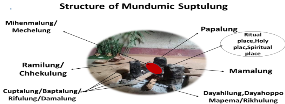
Figure 1. Suptulung (Tin Chula); Sources Shanti Devi Rai's dissertation

Dolokumma, revealing the multiple female character for continuity of universe such as Ribhyama, Naima, Sumnima, and other, each stand for creation, continuity and connection with nature. Story of Ribhyama is very short but she is symbolized for air. Because, her present interpret the air, and breathing. Existence of Naima is for create, and management of nature. Mundum Risiya interpret as the nurture of nature, the solar system, climate change because of Naima. While Sumnima linking with human development, visible-invisible, death and birth, Suptulung, integrate total human life, universe, spiritual power, moral value of community, legacy, knowledge transfer place, and civilization. Indigenous knowledge is rooted from the land, ritual practices, and nurturing of the nature (Grieves, 2009; Kesis 2012; Kehie 2024; Subba 2023). Mundum knowledge, holistically rooted form land, nature, and ancestral experience. In Mundumic worldview embody divine feminine creation. The main character are Naima and Sumnima, where symbolized of multiple character for continue of universe, and balance of nature. Mundumic symbolic name is connection with earth sprite, and cultural identity's indigenous Kirat Rai community. The sky, land, rock, fire, sea, forest, trees, animal, birds binding the power of ancestors. Social norms and value determine by the reflection of spiritual power.