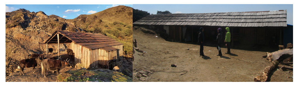
Figure 4: Goth (left) and gothstay (right) at Mathilo Phokte, PGR

In one corner, there are different sizes of wooden or bamboo pots for making butter. Recently, some herders have brought hand-machine for separating cream from milk to save their time and energy. Notwithstanding, the introduction of new technology will be replace traditional instruments and knowledge of making butter in near future. After the cream separation, herders boil milk in a big bowl that stand over the hearth. It helps to separate solid from liquid. The solid item is locally called chhana . The separated chhana is put on jute sack and kept on a big wooden flack and pressured. It helps to remove remaining liquid from solid. It is then kept on bhati above the hearth until ready for selling. All these activities, observed and experienced at the goth reveals that goth is a cultural space to the outsiders or researchers for knowing the Himalayan pastoral culture and way of life.