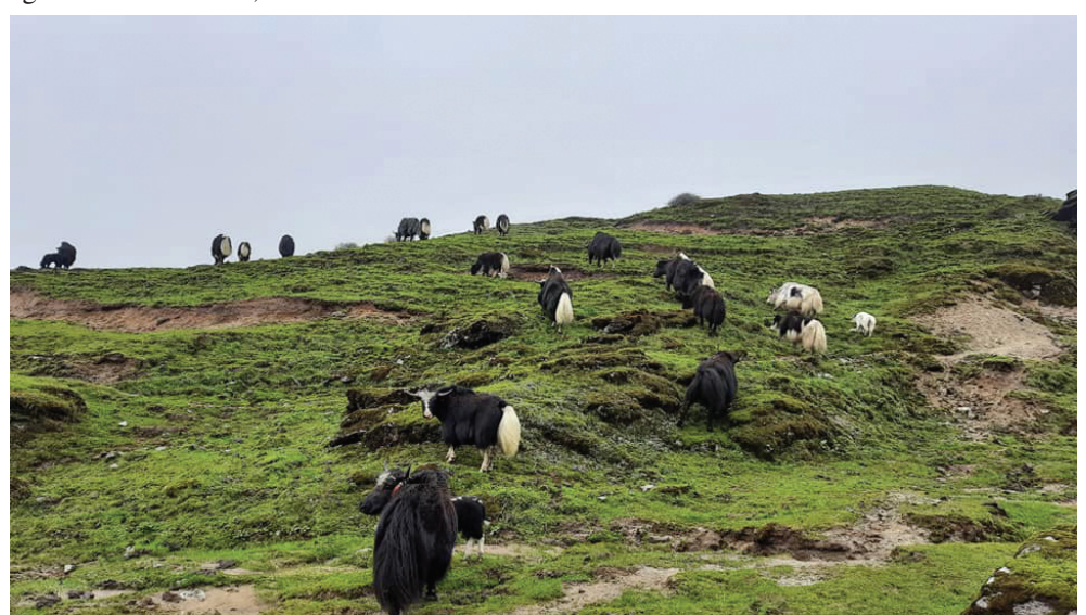
Figure 2: Yaks on the grazing at PGR, (Photo by Chandra Nepal)

of livestock that they possess. Household is the major unit of herds management. Economically active male members of the households generally live in the goth for livestock caring. In 2021, in 6 households, however, female and children were also supporting to care the goth and livestock supervision. In case of absence of active human resources at household, male herders were hired. Herding of mountain region through excluding division of labor based on age and sex was thus, not seen.