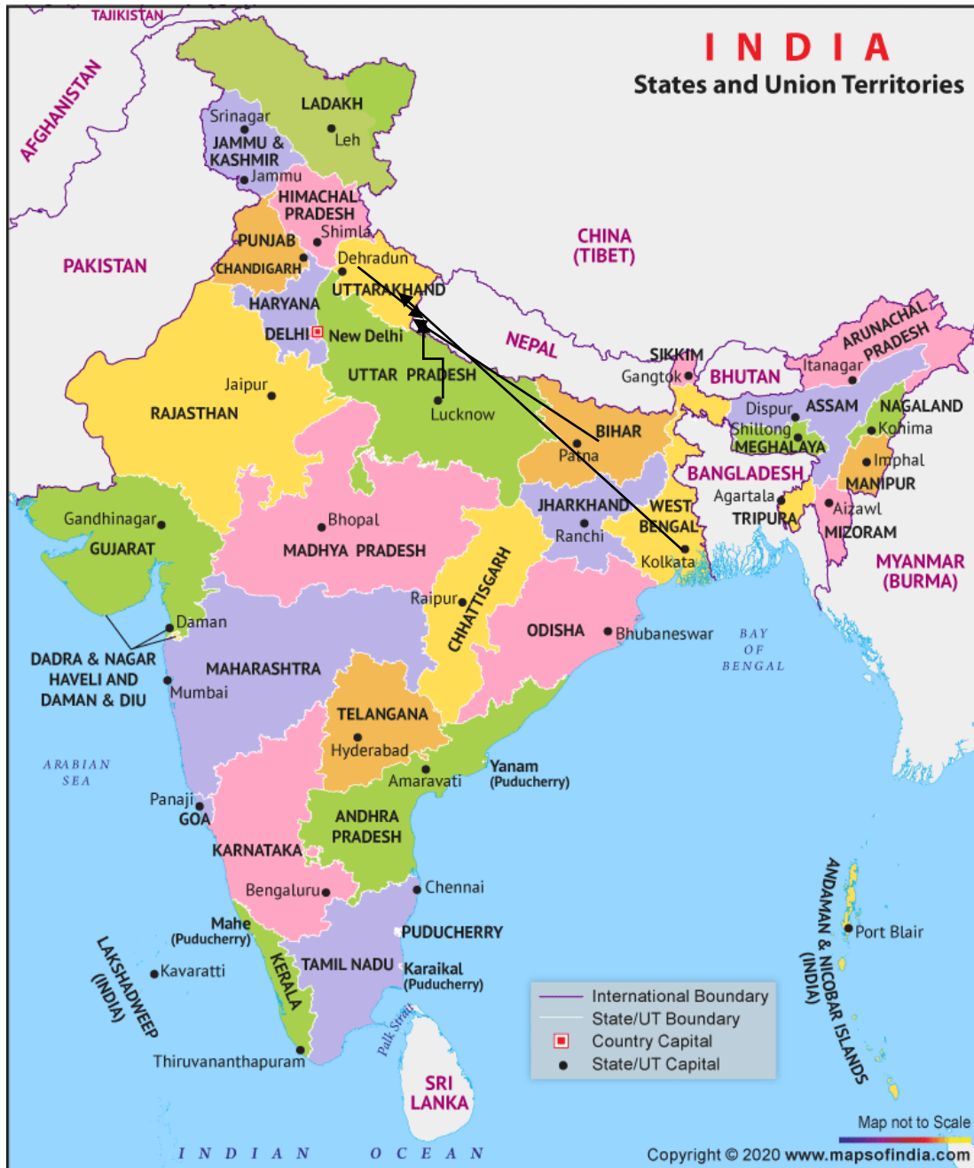
Figure 2: Locations of origion of Indian labour migrants to Nepal from India

Basyal (2014) has also carried out a study about the main destinations of Nepali labour migrants in India are Delhi, Mumbai, Gujarat, Bangalore, Kerala, Pune, Ludhiana, Amritsar, and the hill towns of Almora, Nainital, Shimla and Pithoragarh whereas Seddon and Gurung (2001) mentioned that people from central Nepal moved to Indian cities like Mumbai, Delhi, Kolkata, Varanasi, Agra, Lucknow, Kanpur, Chennai, and Bangalore. Likewise, Bhagat and Keshari (2010) showed that seasonal migration from Nepal to India is highest in Uttar Pradesh (before the restructuring of Uttar Pradesh in the birth of Uttarakhand) followed by Madhya Pradesh, Maharashtra, Andhra Pradesh, and Bihar.