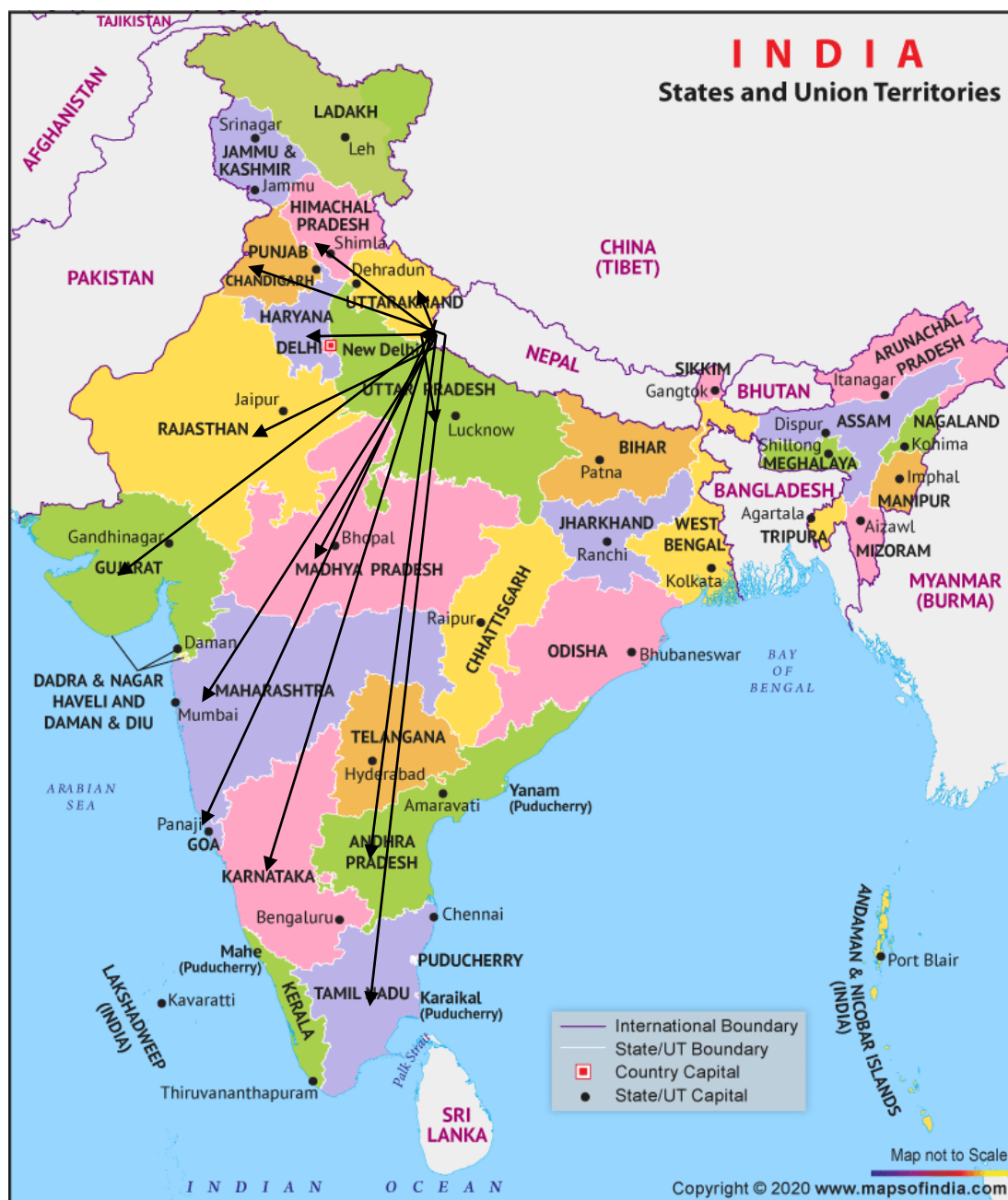
Figure 1: Locations of destination of Nepali labour migrants to India from the study area; Source: www.mapsofindia.com (2020)

The Nepali labour migrants from Bhimdatt Municipality move to different big cities in India. Likewise, Indian labour migrants from Uttarakhand, Uttar Pradesh, Bihar, and West Bengal migrated to Bhimdatt Municipality for work. The majority of people from Uttar Pradesh (India) migrate to Bhimdatt Municipality (Nepal) for work. On the other hand, the larger size of the population from Bhimdatt Municipality moves to Delhi for searching work. Higher the rate of migration from Uttar Pradesh to Nepal reflects a correlation with the nearby distance, open-Nepal border, and chances of employment in all kinds of seasons in Nepal. Likewise, the different sizes of the population from Bhimdatt Municipality migrate to other different cities of India as destinations. The study shows that about 30 percent of people from Bhimdatt Municipality migrate to the capital city New Delhi. Probably, it is due to the higher chances of job availability which is also accepted by thieme (2006).