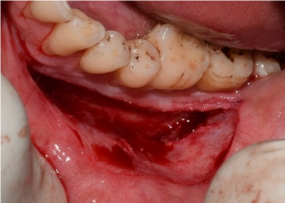
Figure 3: Horizontal incision placed at mucogingival junction followed by supraperiosteal dissection.