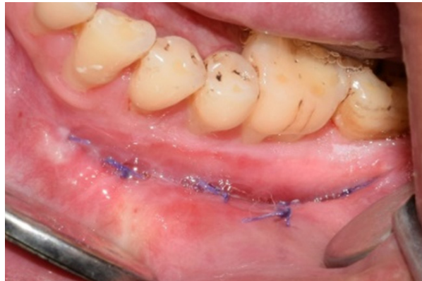
Figure 6: After two weeks of vestibuloplasty.