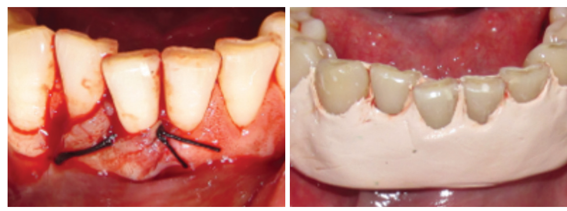
Figure 2c: Sling suture placed.