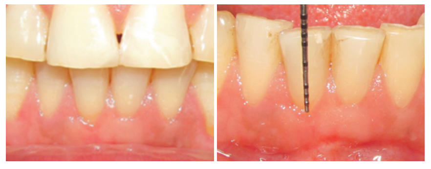
Figure 3d: Two and a half years follow up.