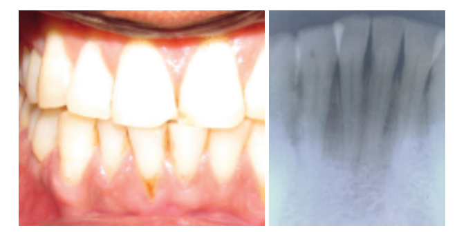
Figure1a: Gingival recession irt 41 and IOPAR.

tobacco consumption, which he used to place in his lower labial vestibule (3-4 times/day). He quit his habit five months back before he visited the hospital. On intraoral examination, positions of teeth were normal. Marginal tissue recession was not extending to mucogingival junction (MGJ) in relation to 41 and intraoral periapical radiograph (IOPA-R) revealed no loss of interdental bone, thus, noting to be Miller's class-I recession defect.<sup>5</sup> Recession defect depth was 3.5 mm and width 2 mm (Figure1a,1b). Scaling, root planing was done and oral hygiene instructions were given. Six weeks after phase I therapy, patient was recalled for root coverage and written consent was taken.