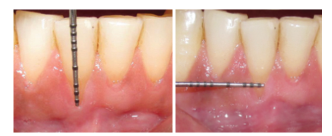
Figure1b: Recession depth- 3.5mm and width - 2mm.