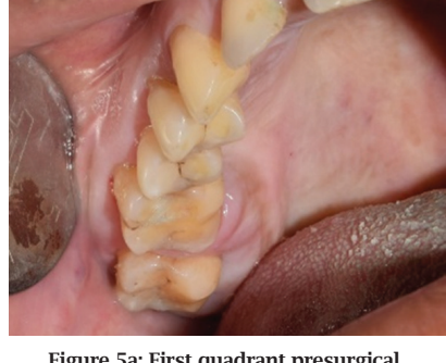
Figure 5a: First quadrant presurgical.