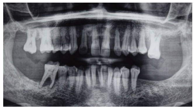
Figure 2: Generalized bone loss.