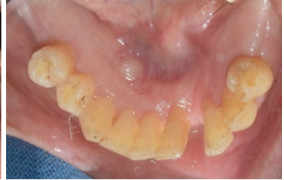
Figure 8c: Occlusal view (lower arch).