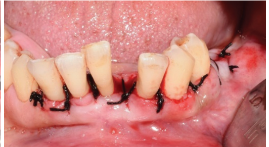
Figure 3b: Suture placed after flap surgery.

excision. Undisplaced flap surgery was started from the third quadrant and second premolar which was extremely mobile was extracted simultaneously (Figure 3a). The flap edges were approximated and sutured (Figure 3b). A part of excised gingiva was sent for histopathological evaluation which revealed elongated rete ridges, underlying connective tissue with dense collagen fibres and chronic inflammatory cell infiltrate chiefly lymphocytes and plasma cells (Figure 4).