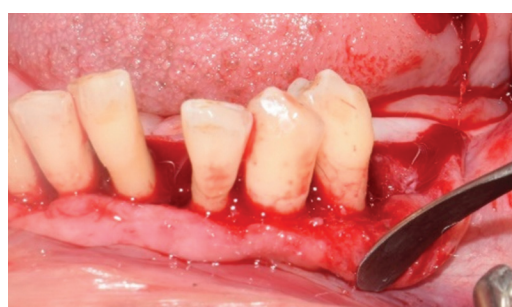
Figure 3a: Undisplaced flap surgery.