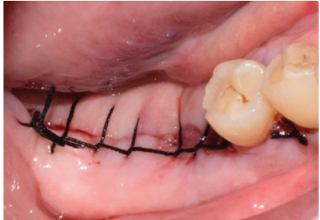
Figure 7c: Suture placed after flap surgery.