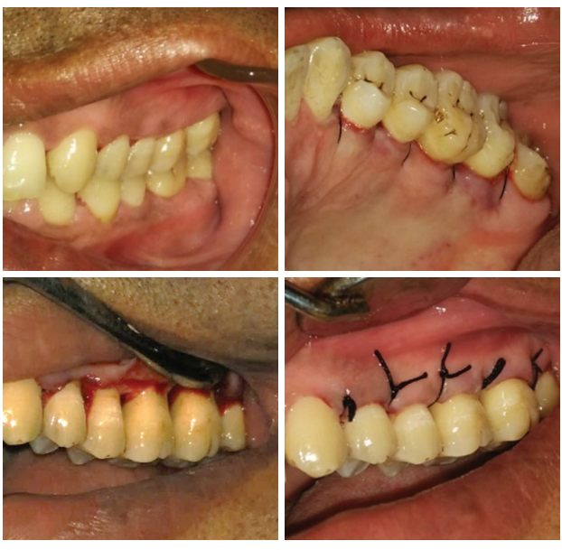
Figure 2: Open flap debridement-Surgical therapy.