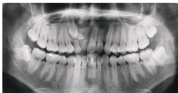
Figure 1: Preoperative Orthopantomogram showing well defined radiolucency around impacted maxillary anterior teeth

Ranking next in the differential diagnosis was adenomatoid odontogenic tumor (AOT) due to characteristic location of