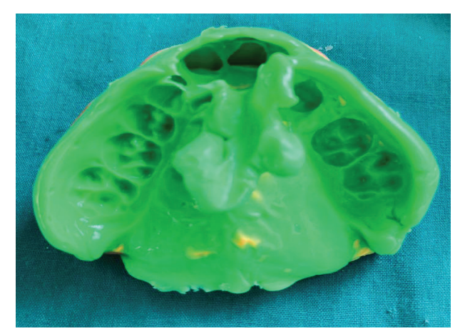
Figure 3: secondary impression made with putty and light body elastomer