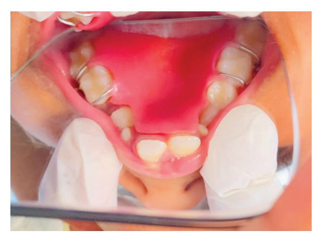
Figure 5: palate with prosthesis