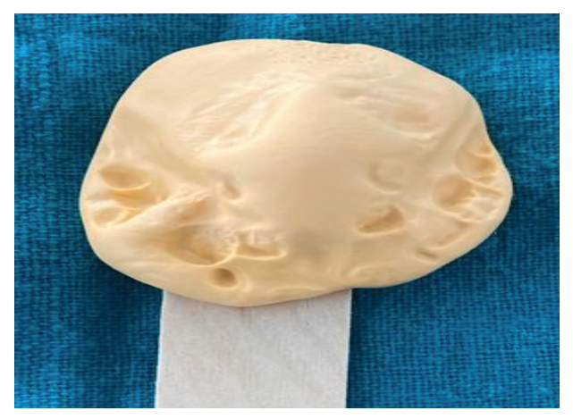
Figure 2: primary impression made with putty