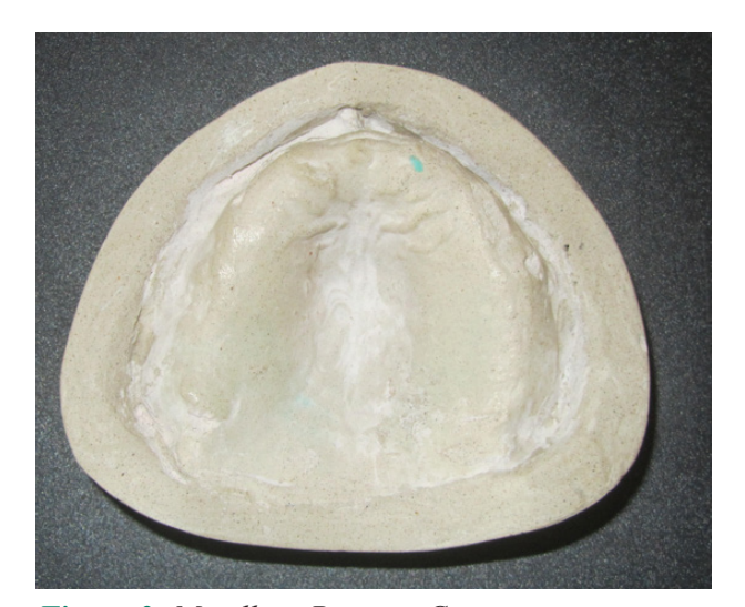
Figure 3: Maxillary Primary Cast