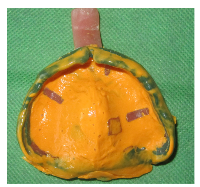
Figure 5: Final Impression