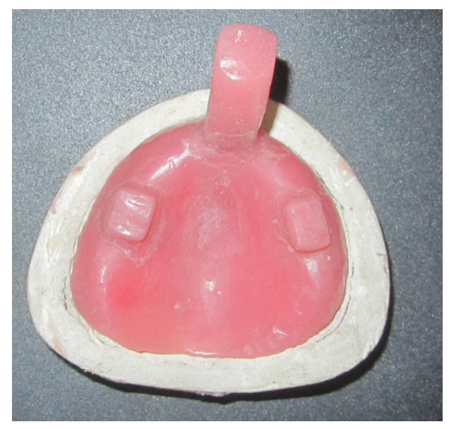
Figure 4: Maxillary Special tray