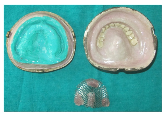
Figure 10: Maxillary Metal Mesh prior to packing the denture