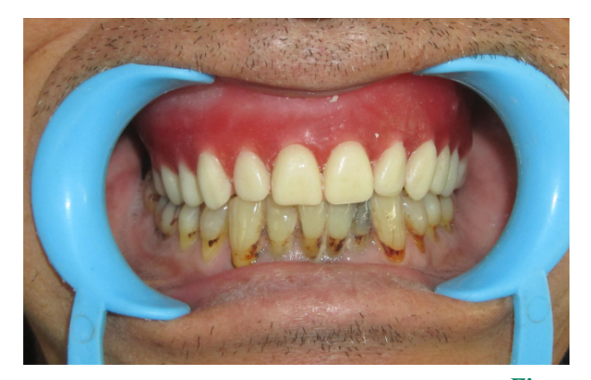
Figure 9: Try In