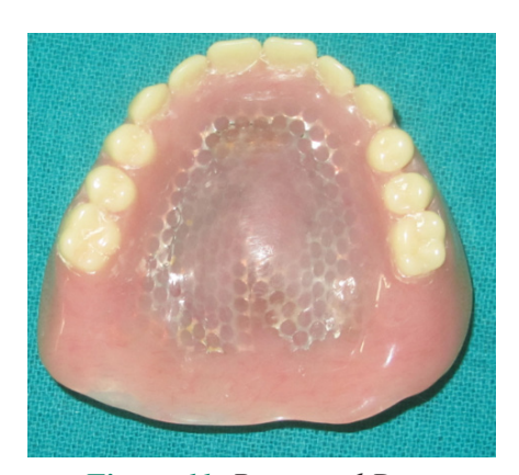
Figure 11: Processed Denture