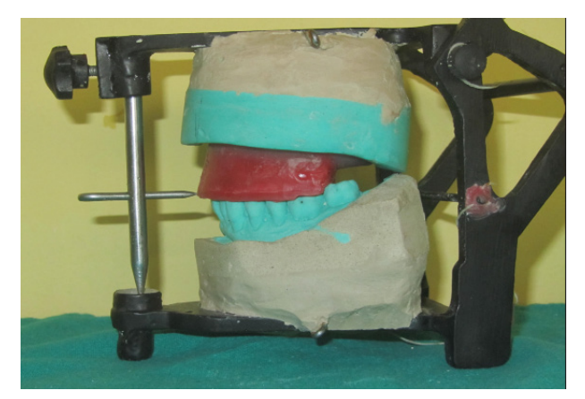
Figure 8: Mounting of casts in articulator