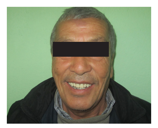
Figure 13: Improved esthetics after denture insertion