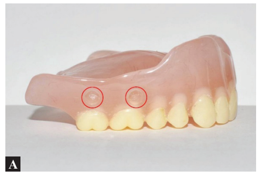
Figure 3A: Engraved recesses