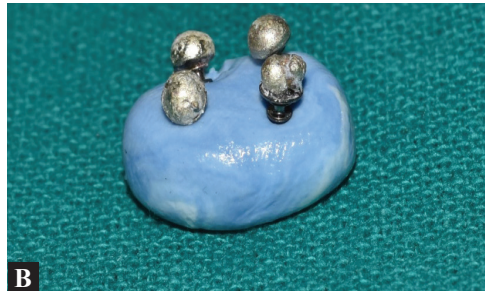
Figure 2A: Mount the lingual Figure 2B: Lingual button with increased height after soldering