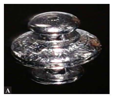
Figure 1A: Lingual button