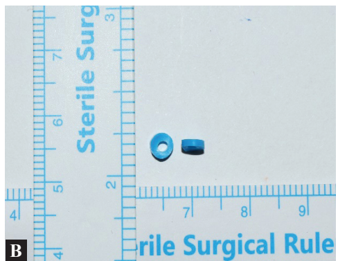
Figure 1B: Orthodontic tooth separators