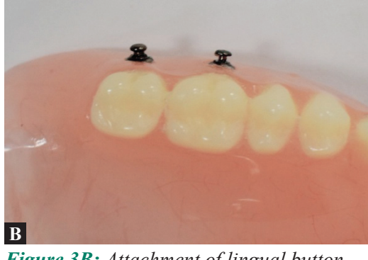
Figure 3B: Attachment of lingual button