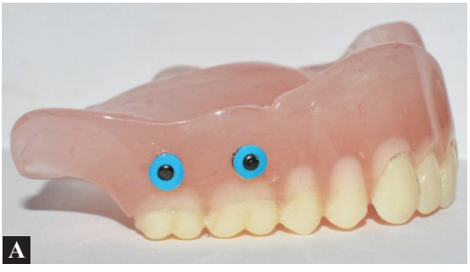
Figure 4A: Seated orthodontic tooth