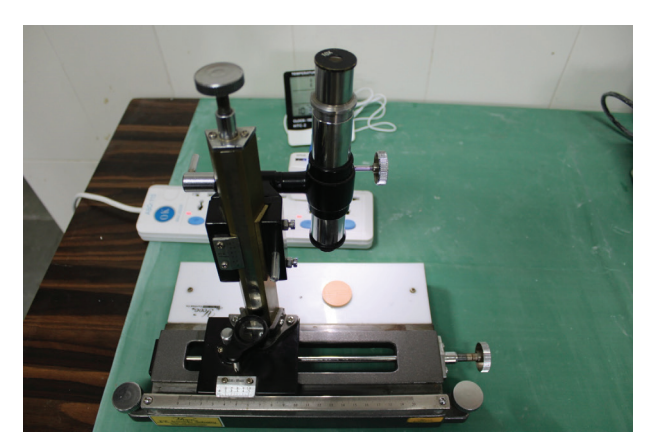
Figure 5: Travelling microscope of 10x