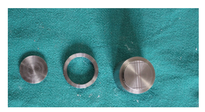
Figure 1: The mold with three horizontal and two vertical grooves, riser and test material mold

The dimensional change in dry and wet conditions were compared using independent sample t test at different time intervals (Table 4). It showed that there is no statistical difference between the dimensions up to 12 hours after setting (p>0.05). The dimensional change was significantly different in two conditions in 24 hours and 36 hours of storage (p<0.05).