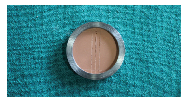
Figure 3: Preparation of test molds