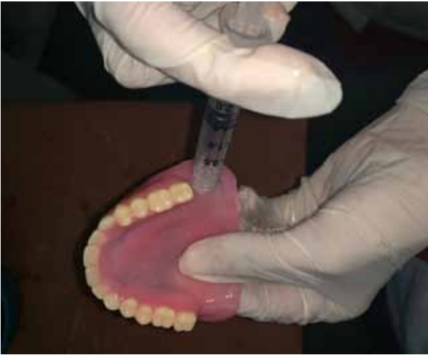
Figure 8: incorporation of glycerine in the denture