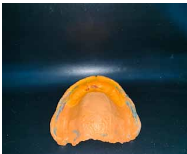
Figure 4: wash impression