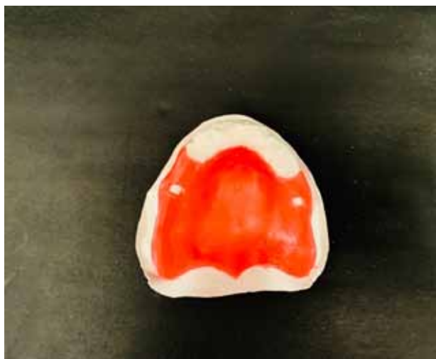
Figure 2: Spacer design excluding the flabby region in the anterior region