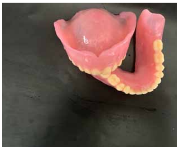
Figure 7: Finished and polished denture