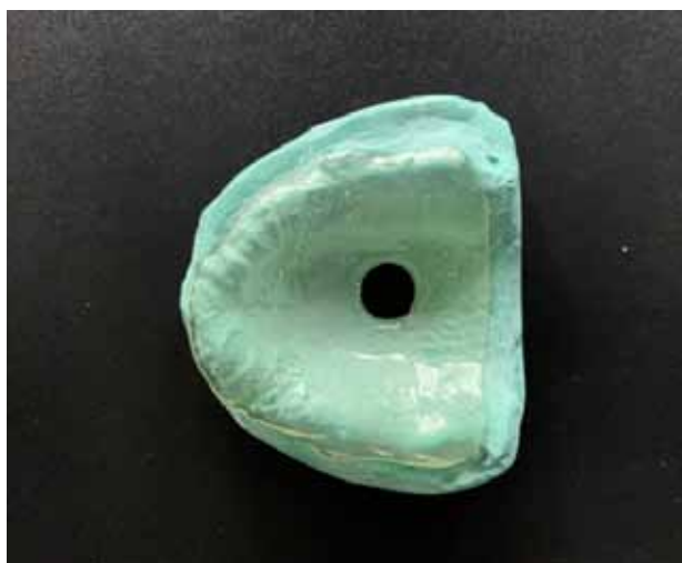
Figure 6: 1mm thick flexible polyethylene sheet incorporated in the maxillary denture which was 2mm short of borders