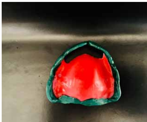
Figure 3: Border molding performed