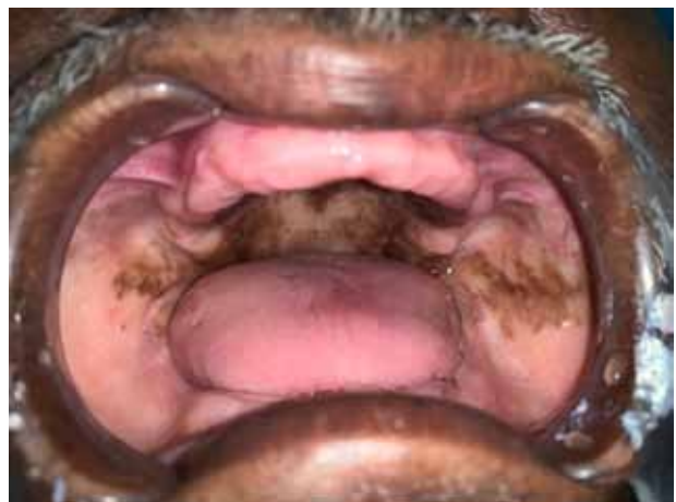
Figure 1 : Anterior flabby ridge present in maxilla