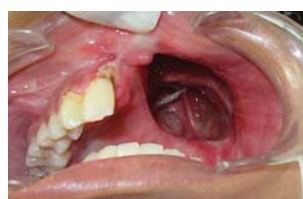
Figure 1: Intraoral occlusal view

The obturator was then inserted intra-orally to evaluate the fit, verification of the occlusion and esthetic. (Fig.13). The patient was trained to do insertion and removable of the prosthesis and instructed to masticate on the non-resected side only. Maintaining hygiene, limitation of the prosthesis and recall protocol was explained. Recall and follow up was done after 1 week, 1 month, 3 months and 6 months. Functional, esthetic and psychological comfort of the patient could clearly be perceived during his follow-up visits.