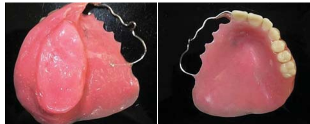
Figure 11: Intaglio surface