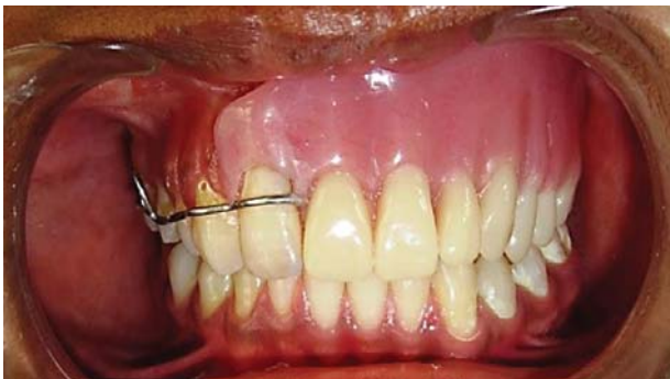
Figure 13: Closed hollow bulb obturator delivery