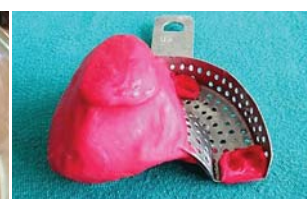
Figure 2: Tray modification with impression compound