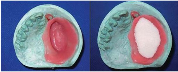
Figure 5: The defect area was lined with approximately 2 mm thick layer of autopolymerizing acrylic resin