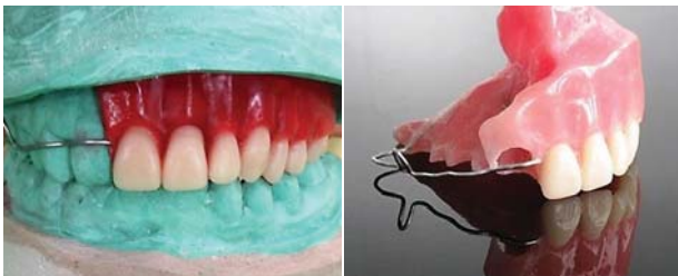
Figure 9: Teeth arrangement