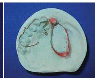
Figure 4: Cast with fitted labial bow